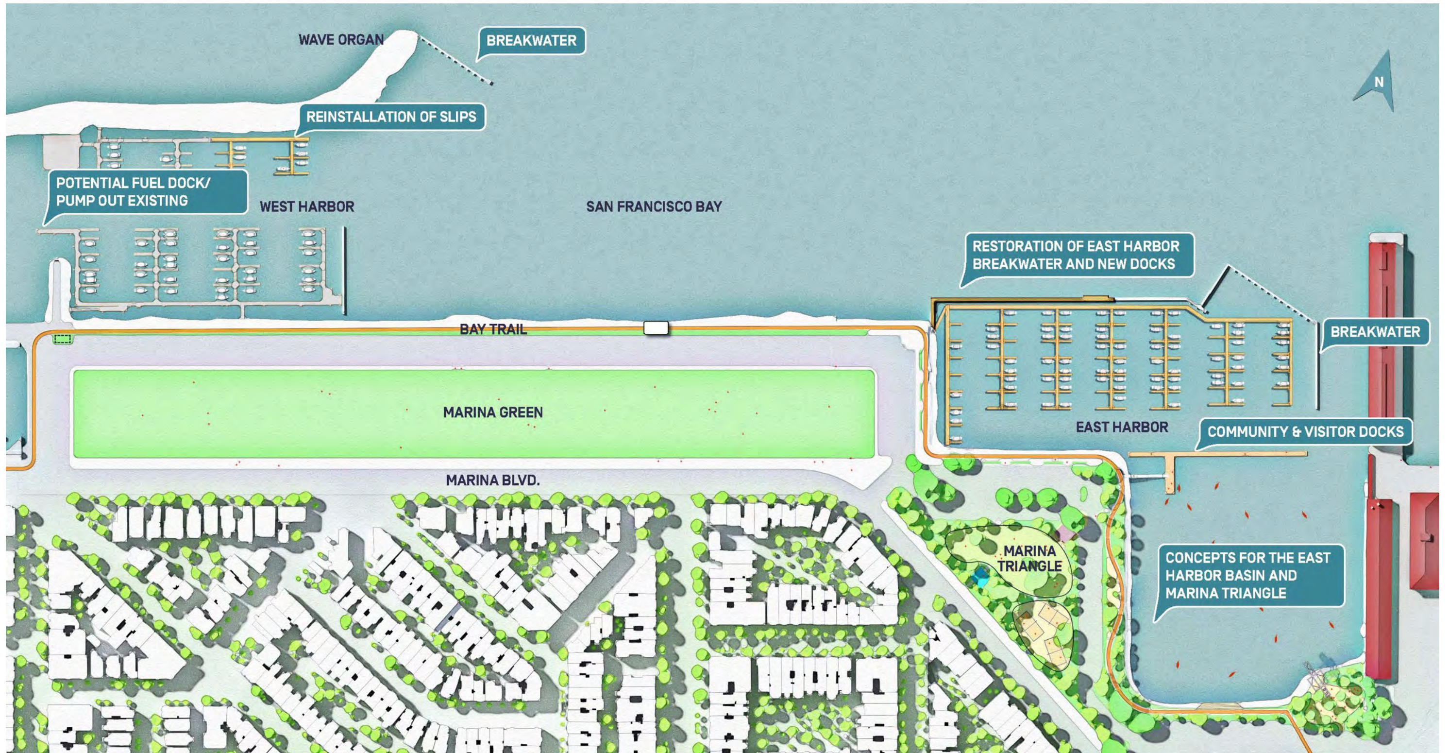
Figure 4. Project Marina Improvements Overview San Francisco Marina Improvement and Remediation Project