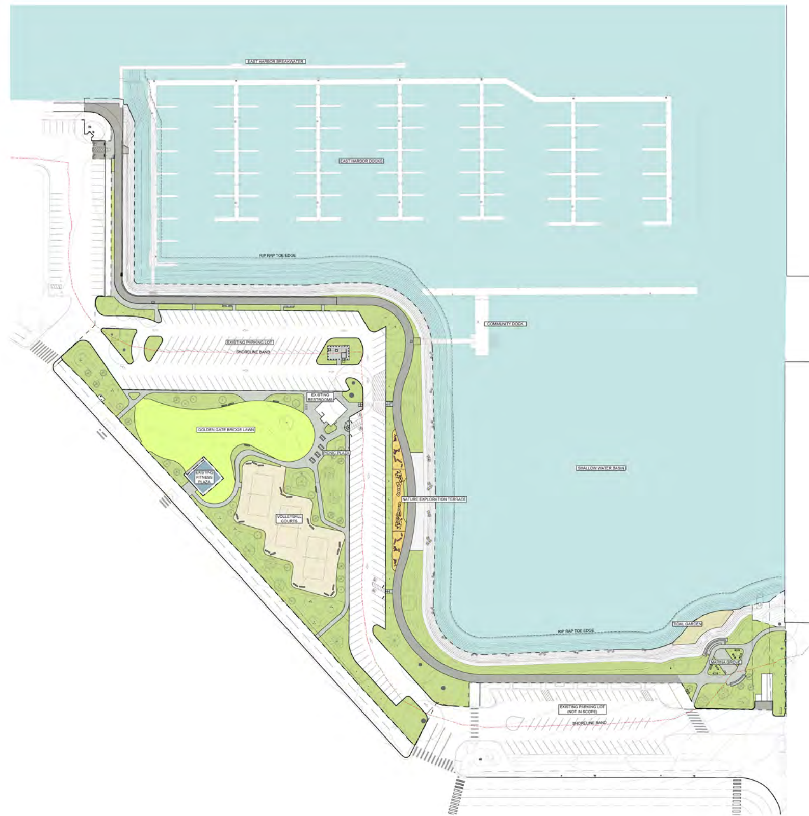
Figure 5. Shoreline Enhancement Overview San Francisco Marina Improvement and Remediation Project

0 50' 100' 150' SCALE: 1" = 50' ON 24"X36" (ARCH D)