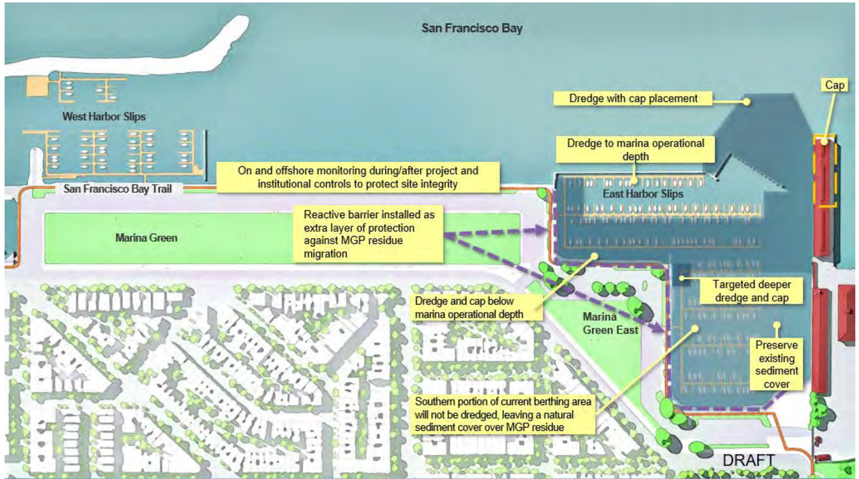
Figure 3. Project Remediation Components Overview San Francisco Marina Improvement and Remediation Project