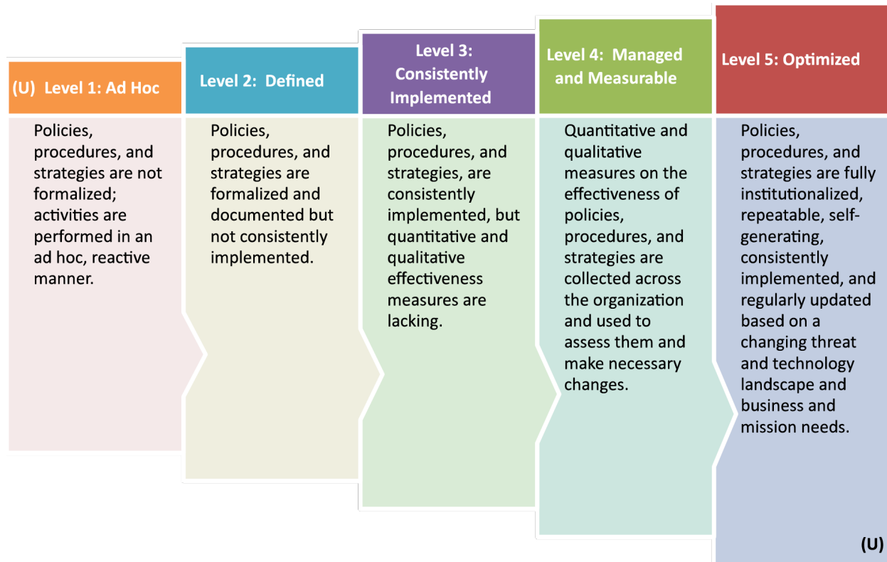
(U) Figure 1. IG FISMA Maturity Model

(U) Source: FY 2023 – 2024 IG FISMA Reporting Metrics.