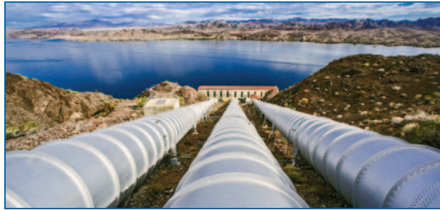
Whitsett Intake Pumping Plant on the Colorado River.

Your water supply is a blend of groundwater pumped from two active local wells by the City of Seal Beach Utilities Division and water imported from Northern California and the Colorado River by the Municipal Water District of Orange County (MWDOC) via the MWD.