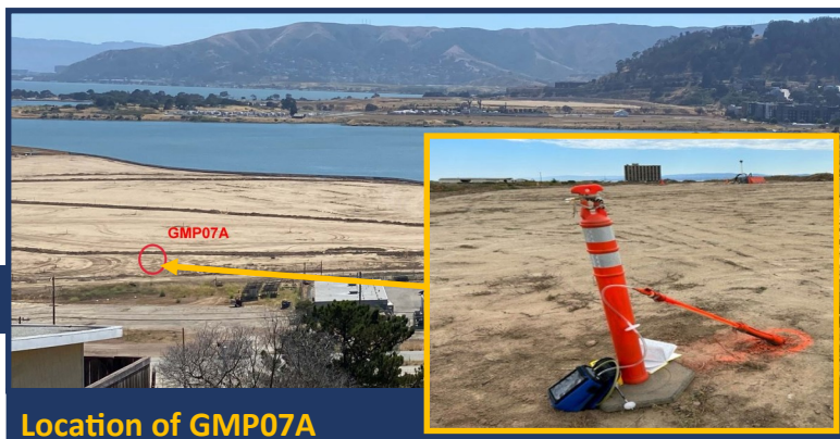
Location of GMP07A