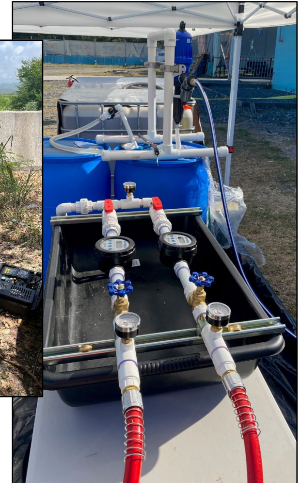
SWMU 55 Injection Manifold