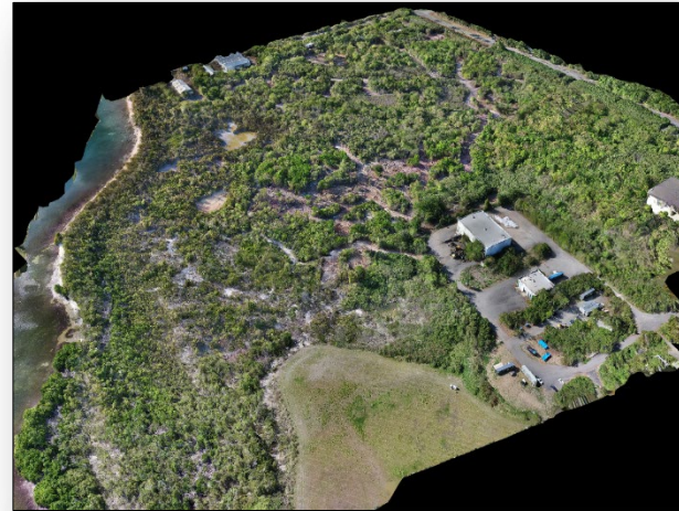
SWMU 70 Post Debris Removal