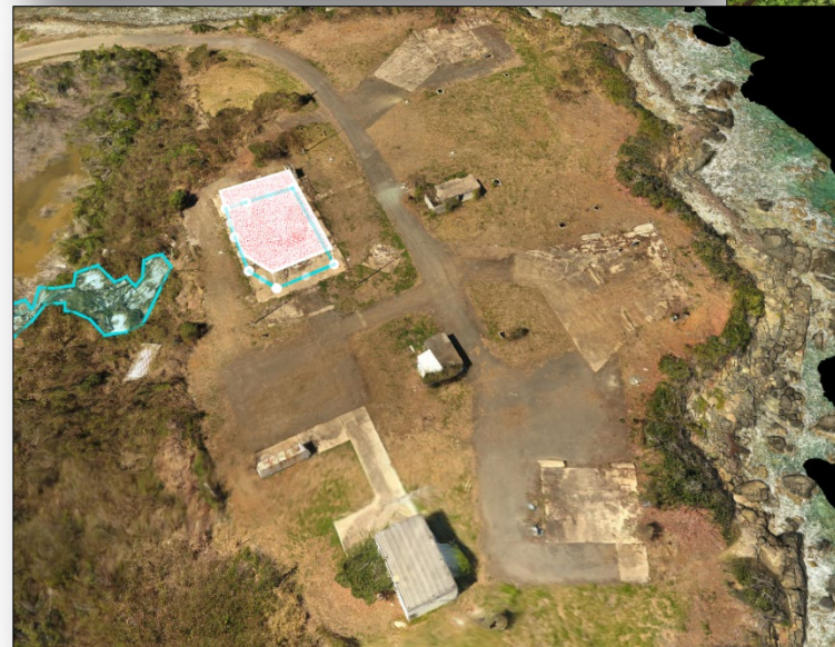
SWMU 79 Investigation Area