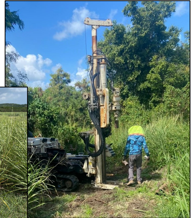
SWMU 74 Direct Push Soil Sampling