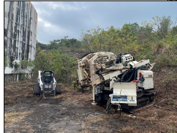
AOC F Soil Sampling

Piñeros Island is restricted from public use due to the potential presence of munitions on the beach and land areas, as well as the surrounding underwater