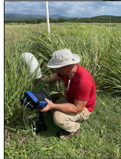
SWMU 3 Landfill Gas Monitoring