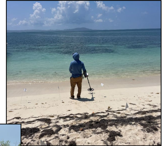
Piñeros Beach Clearance

Piñeros Island is restricted from public use due to the potential presence of munitions on the beach and land areas, as well as the surrounding underwater