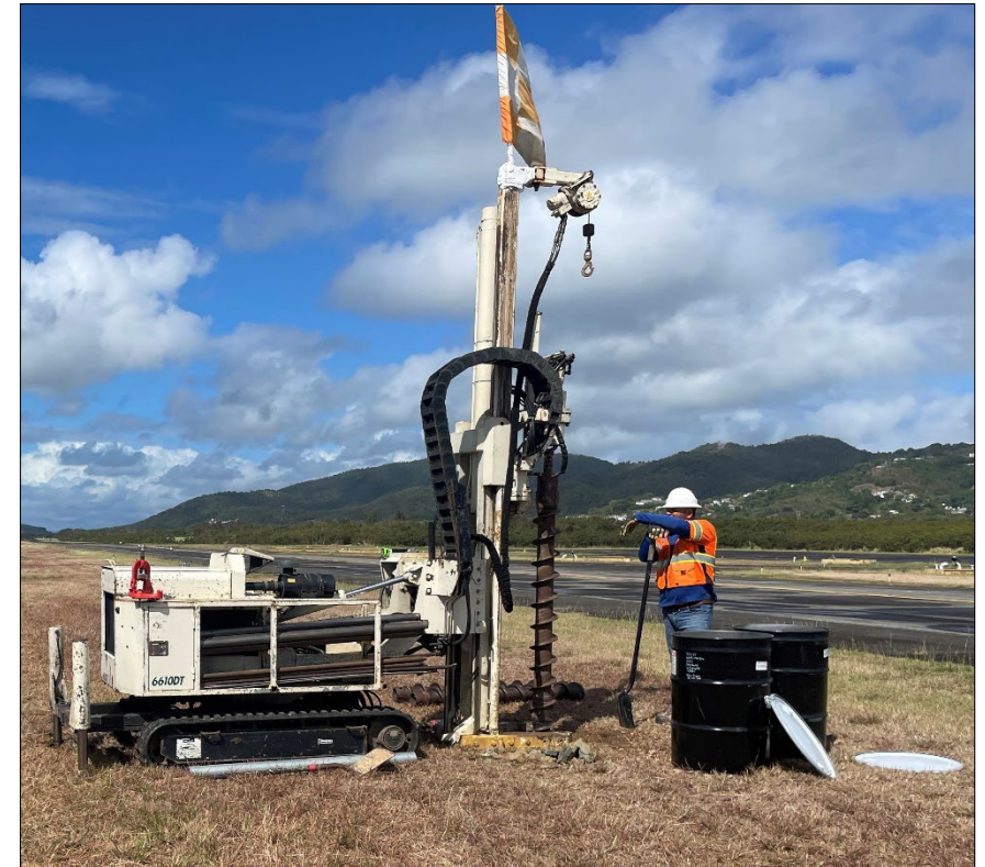
Monitoring Well Installation