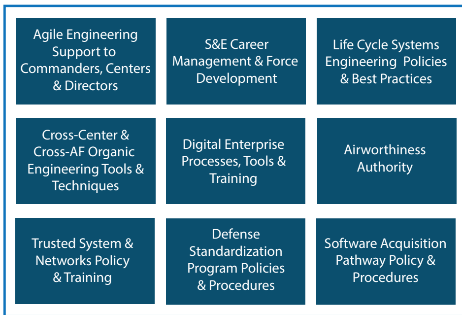
Figure 1: HQ AFMC/EN Missions (further detailed in HQ AFMC Mission Directive 401)

HQ AFMC/EN exists to develop and empower the nearly 15,000 scientists and engineers across AFMC. As the chief engineer and technical authority for AFMC, we provide technical leadership and policy guidance to the command's senior leaders and the technical workforce across the command's six centers which include Air Force Research Laboratory, Air Force Life Cycle Management Center, Air Force Nuclear Weapons Center, Air Force Test Center, Air Force Sustainment Center, and Air Force Installation and Mission Support Center. AFMC/EN also provides matrixed technical support to the HQ AFMC staff including A3/6, A4/10, A5/8/9, and Safety (AFMC/SE). An overview of key missions is depicted in Figure 1.