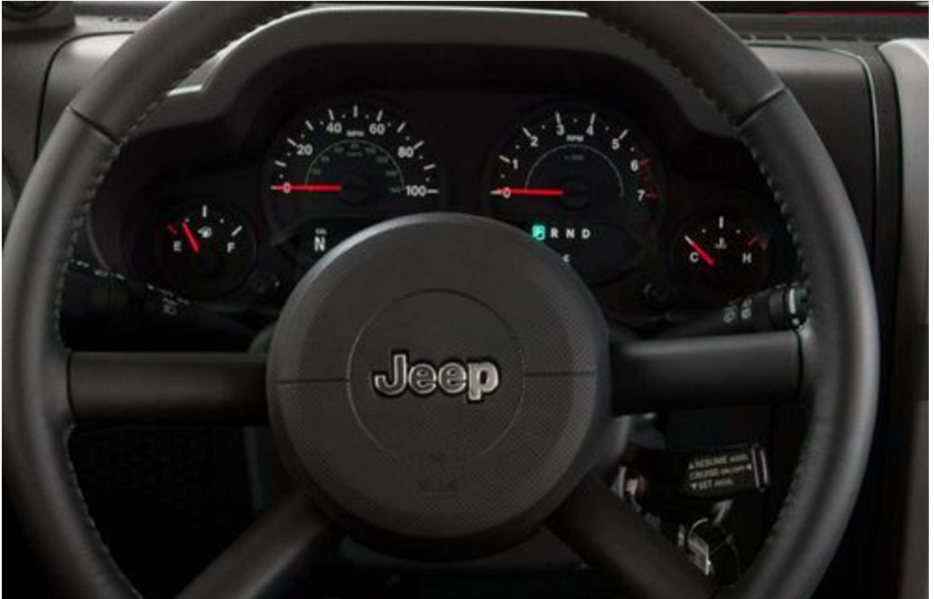
F*Stock Photo of 2008 Jeep Wrangler