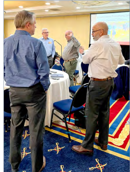
DoD OIG staff members