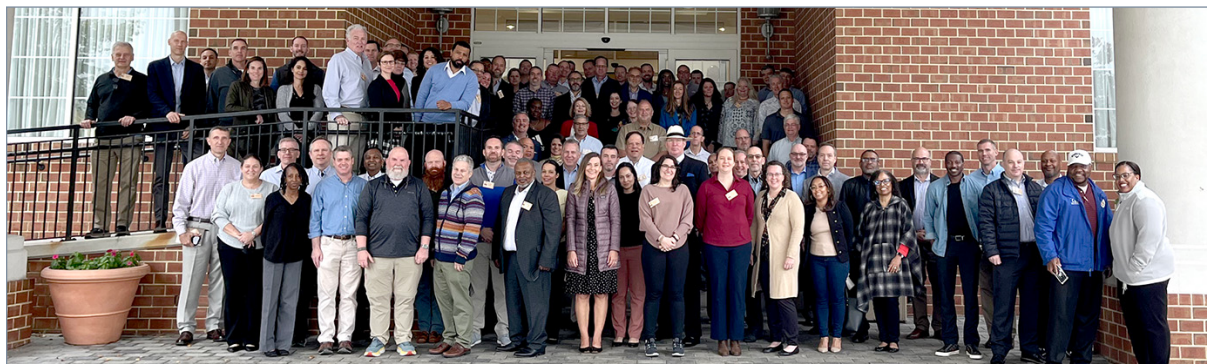
DoD OIG team members

The DoD OIG effectively uses data to identify systemic issues, target high-risk areas, and inform audits, evaluations, investigations, and reviews. In all endeavors, the DoD OIG maintains the highest standards in protecting the interests of the American public. The DoD OIG leverages the diverse backgrounds and experiences of its staff and operate