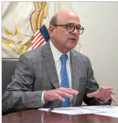
Robert P. Storch, Department of Defense Inspector General

The Department of Defense's enduring mission is to provide combat-credible military forces needed to deter war and protect the security of our nation. The Department of Defense