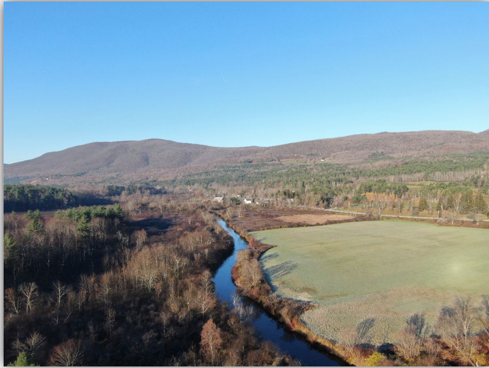
Batten Kill River, Manchester, Vermont.

Annual Report – July 1, 2022– June 30, 2023