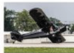
FRANKLIN'S FLYING CIRCUS AND AIRSHOW