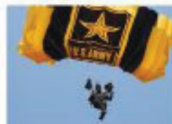
U.S. ARMY GOLDEN KNIGHTS