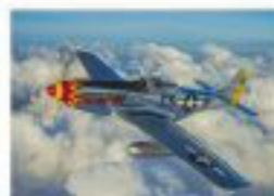
THE SWAMP FOX