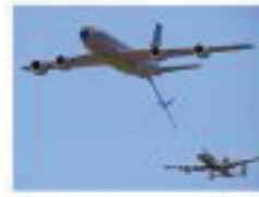
SELFBRIDGE A-10 THUNDERBOLT II AND KC-135 STRATOTANKER