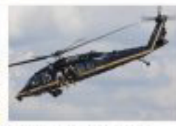
U.S. CUSTOMS AND BORDER PATROL