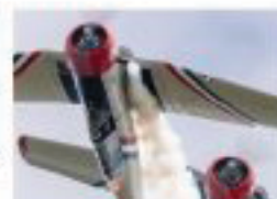
WARBIRD THUNDER AIRSHOWS

WE ARE THRILLED TO SHARE THAT PREPARATIONS ARE WELL UNDERWAY THE 2024 EVENT AS WE DILIGENTLY WORK TOWARDS SECURING AN INCREDIBLE LINEUP OF PERFORMERS. WHILE WE'RE STILL IN THE PROCESS OF FINALIZING ACTS, WE ARE DELIGHTED TO ANNOUNCE THAT THE WORLD-RENOWNED USAF THUNDERBIRDS WILL BE HEADLINING OUR SHOW. THEIR AWE-INSPIRING AEROBATIC DISPLAYS AND PRECISION MANEUVERS ARE SURE TO CAPTIVATE AUDIENCES AND CREATE A THRILLING EXPERIENCE FOR ALL ATTENDEES. A