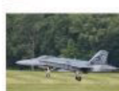
CANADIAN CF-18 DEMO