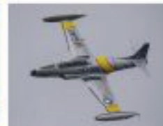
ACE MAKER AIRSHOWS