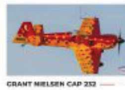
GRANT NIELSEN CAP 232