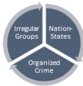
Figure 1. Silent Partners

with OCGs or irregular groups. In addition, there is also political pressure on those involved in state-building interventions to get positive results quickly. This often results in a lack of appetite on the part of policymakers and decision-makers at home to recognize the reality on the ground.