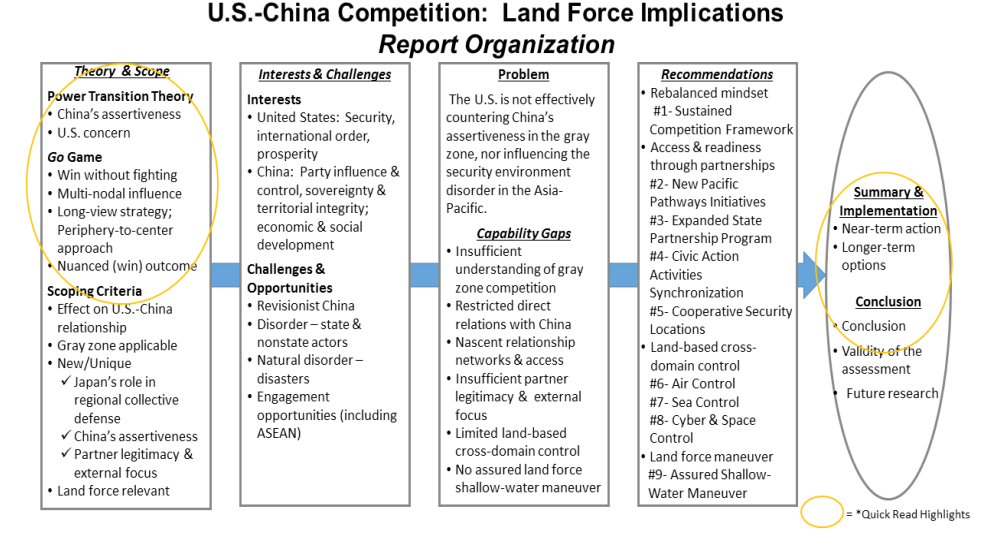
Figure 1. Report Logic Map with Quick Read Highlights.

The report offers nine specific recommendations and a two-tier implementation plan to integrate those recommendations into defense management processes. (See Figure 1.)