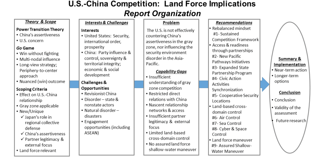
Figure 2. Report Logic Map.

The report logic map begins with a discussion of power transition theory and a Chinese "go game" analogy to rationalize the report's central focus on the U.S.-China relationship, explain the nature of gray zone competition in the Asia-Pacific, and highlight the vital role that U.S. engagement of regional allies and partners plays in achieving strategic outcomes.