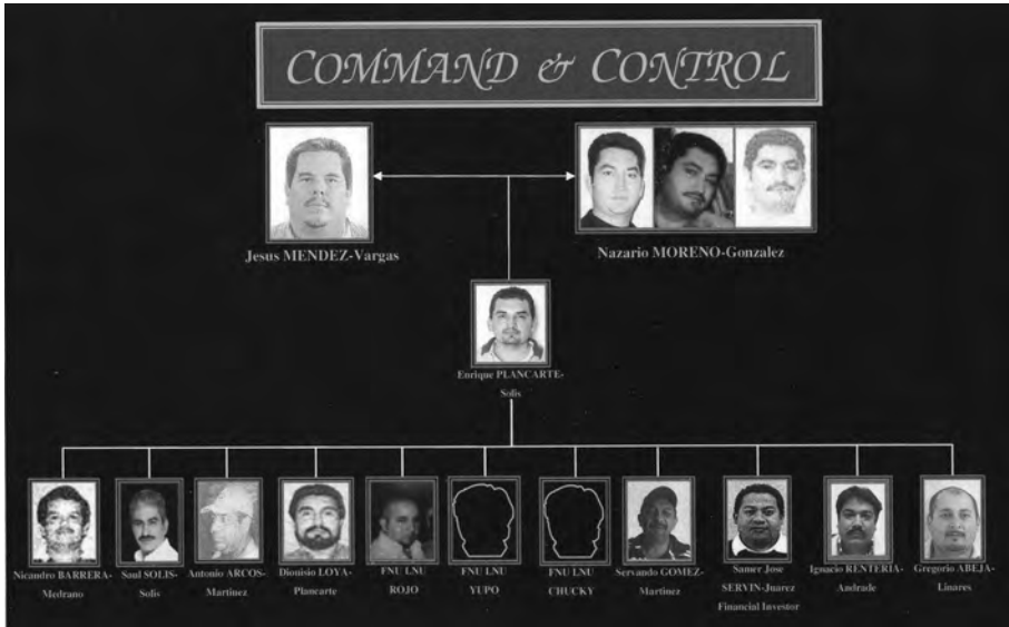
Figure 2. Structure of La Familia Michoacana.

Figure 2 indicates the key members of La Familia. Appendix 2 furnishes a more expansive list of present and former leaders, specialized operators, and notable apparatchiks.