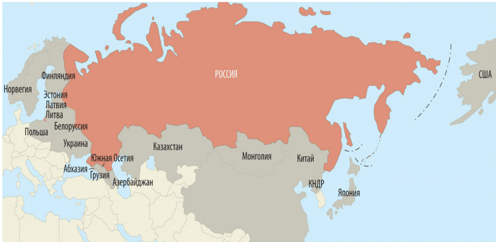
Map 1. Russian Territorial Borders.