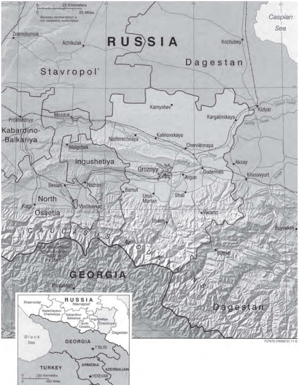
Map 2. Chechnya and Neighboring Russian Republics.