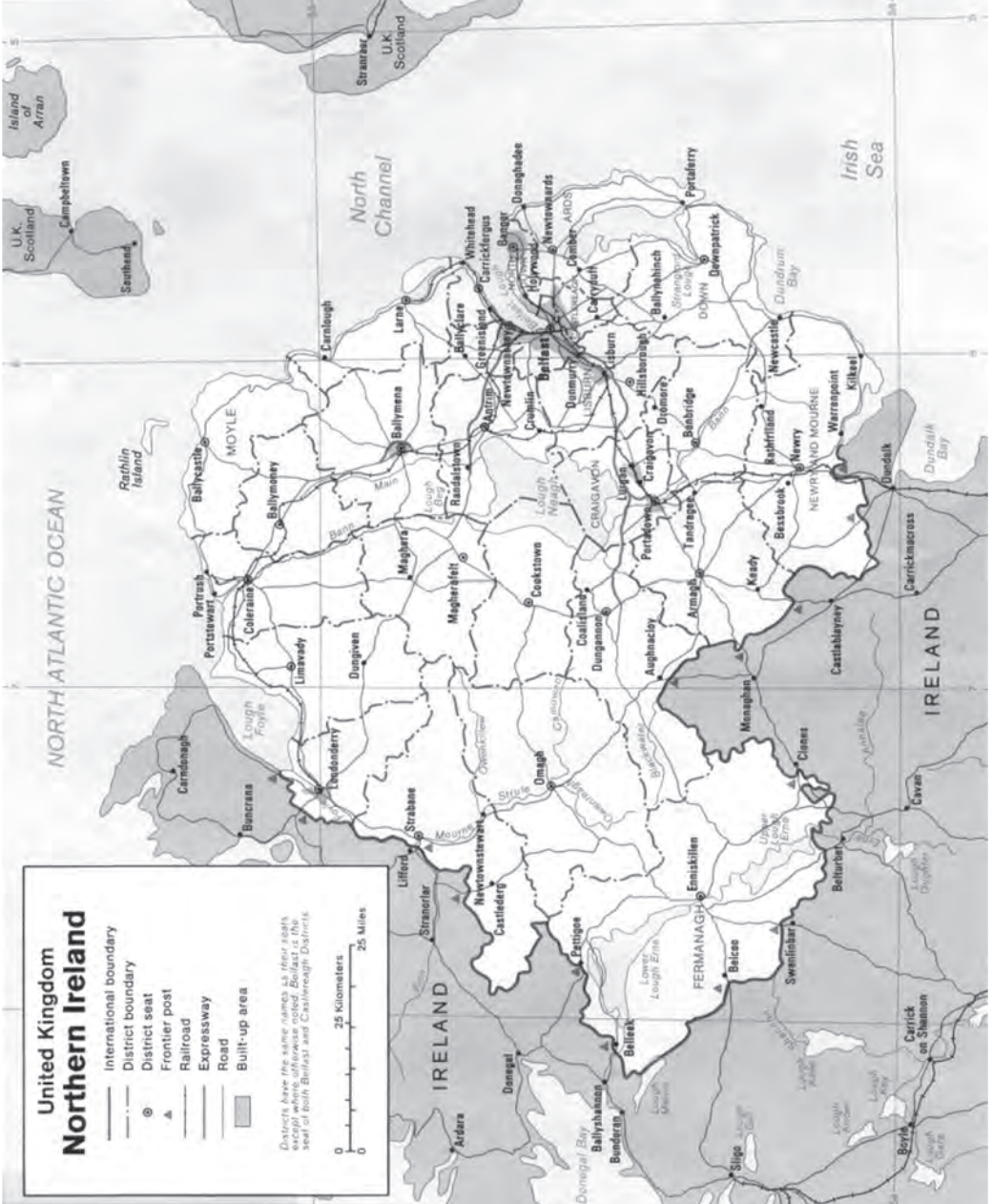
Map 1. Northern Ireland.