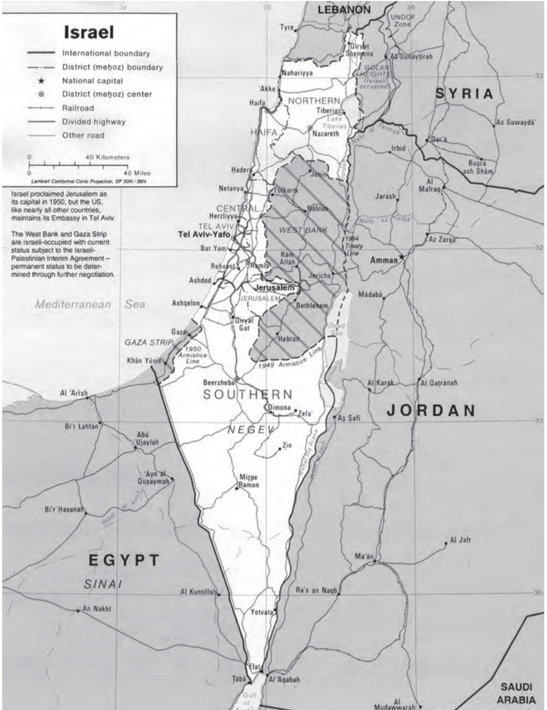
Map 3. Israel, the Gaza Strip, and the West Bank.