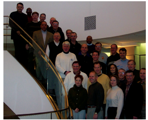
Thirty senior leaders from the Installation Management Agency gathered in Collins Hall to conduct strategic planning

IMA VISION: The preeminent Department of Defense agency that produces highly effective, state-of-the-art installations worldwide, maximizing support to People, Readiness and Transformation.