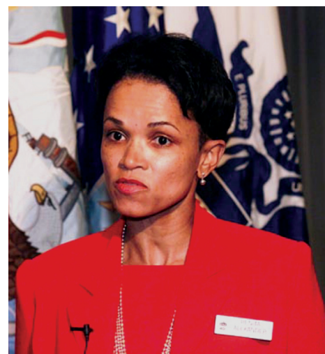
A student fields questions from the press as part of the SCE experience

The Strategic Crisis Exercise is continually assessed and revised to give the students an up