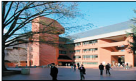
The Intercultural Center at Georgetown University

The exercise is a scenario-driven negotiations exercise focused on coalition building. Participants are divided into seven teams representing the Ministries of Defense of nations with competing interests in the Caucasus region. A control team provided the scenario drivers and played other regional and international actors.