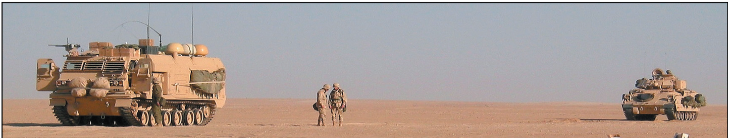
Corps Commander Command and Control Vehicle with Bradley Escort

The first Gulf War was conducted with legacy systems straddling the industrial and emergent information age. The major combat operations phase of Operation Iraqi Freedom (OIF), on the other hand, put into practice information age constructs and theory for the first time in warfare and was an impressive success in its speed and lethality. The impact of that network enabled campaign (often referred to as Network Centric Warfare) is the topic of a study conducted by the Center for Strategic Leadership, U.S. Army War College and commissioned by the Office of Force Transformation, U.S. Department of Defense. The study will be completed by the fall of 2005, but first drafts of the study hint at valuable operational and strategic insights.