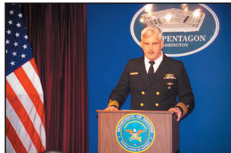
Student CNO conducts a press briefing.

During the last week of March and the first week of April, the U.S. Army War College students dealt with crisis situations ranging from major combat operations to humanitarian assistance, as part of the eleventh annual Strategic Crisis Exercise (SCE). This capstone learning event is a key part of the College curriculum designed to develop the next generation of strategic leaders. These will be leaders who will operate in a challenging joint, interagency, inter-governmental and multinational setting.