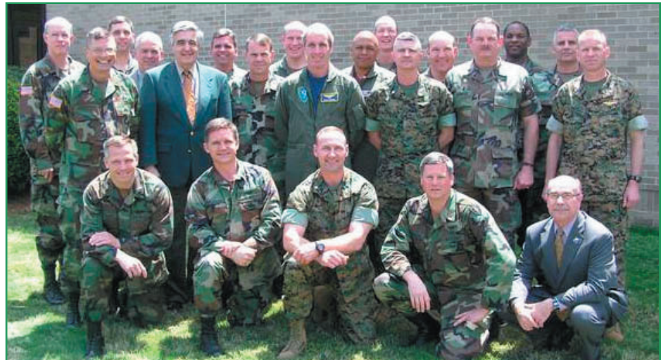
USAWC student, staff and faculty participants in the JLASS Elective Course.

The exercise, guided by the participants’ own goals and objectives challenged the students to increase their understanding of the interagency process, the elements of national power, emerging technology, transformation, and joint and combined operations. Students worked through tough post-conflict, transition as well as combat issues. This unique and dynamic nature of the course makes JLASS one of the military’s more valuable tools in its mission to prepare the leadership for the challenges of tomorrow.