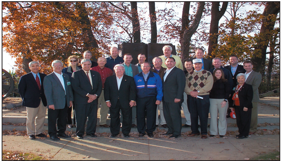
The House Veteran Affairs group in front of the High Water Mark Memorial at The Angle during their walking tour of the Gettysburg Battlefield.

The Collins Center hosted the U.S. House of Representatives Veterans Affairs Committee and numerous Veterans Service Organizations (VSO's) for an