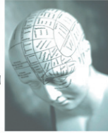
Figure 1: Ten Insights

relationships and patterns (Figure 1). The five Proteus “planes of influence” 4 which closely mirror the information age warfare domains, add additional resolution, but at the same time show the complexity of multiple planes where actors are influenced or where they influence others (Figure 2). These ten “Insights” point toward a new way of considering actions or unintentional consequences of strategic decisions; either commercial, diplomatic or military. These insights can be used as a set of lenses to view future issues through a different mindset, to consider issues through a different value set, and to think creatively, not traditionally. The PIs are applicable at all levels whether developing national security policy, conducting strategic intelligence or developing military theater security assistance or