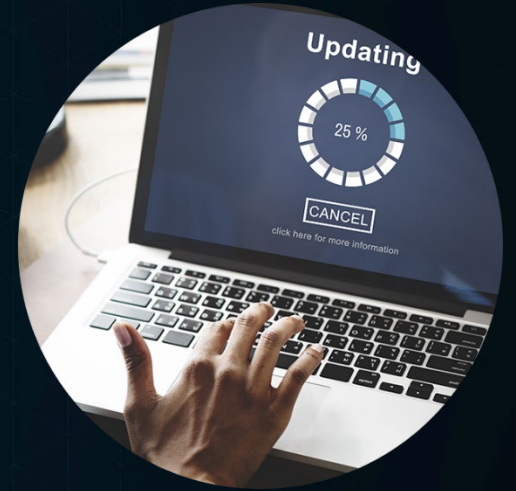
Lowered Updating Risk