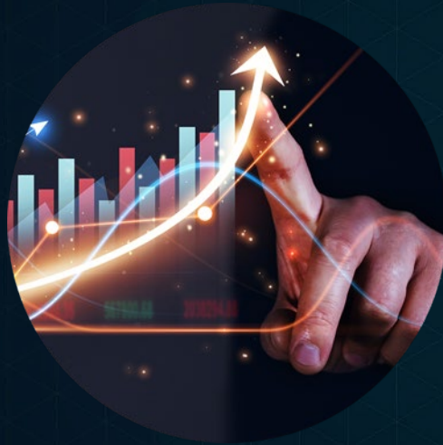
Improved User Experience