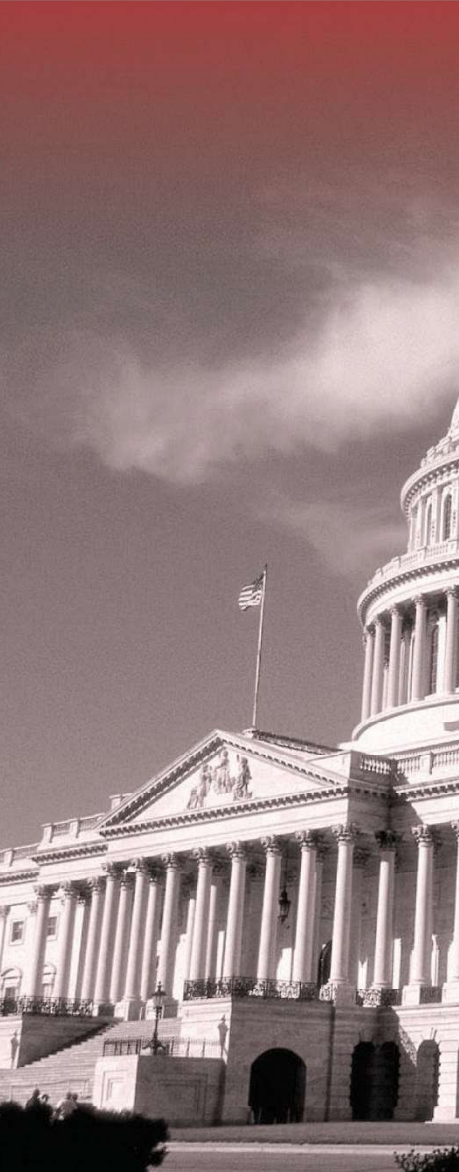
DEPARTMENT OF DEFENSE | OFFICE OF INSPECTOR GENERAL

4800 Mark Center Drive Alexandria, Virginia 22350-1500 www.dodig.mil DoD Hotline 1.800.424.9098