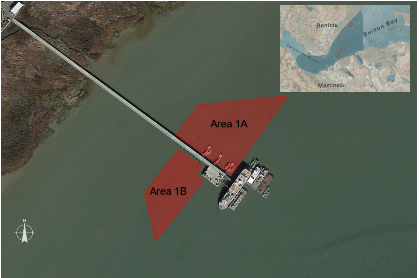
Figure 2: Area 1 Project Location and Limits .

1200 New Jersey Avenue S.E. Washington, DC 20590