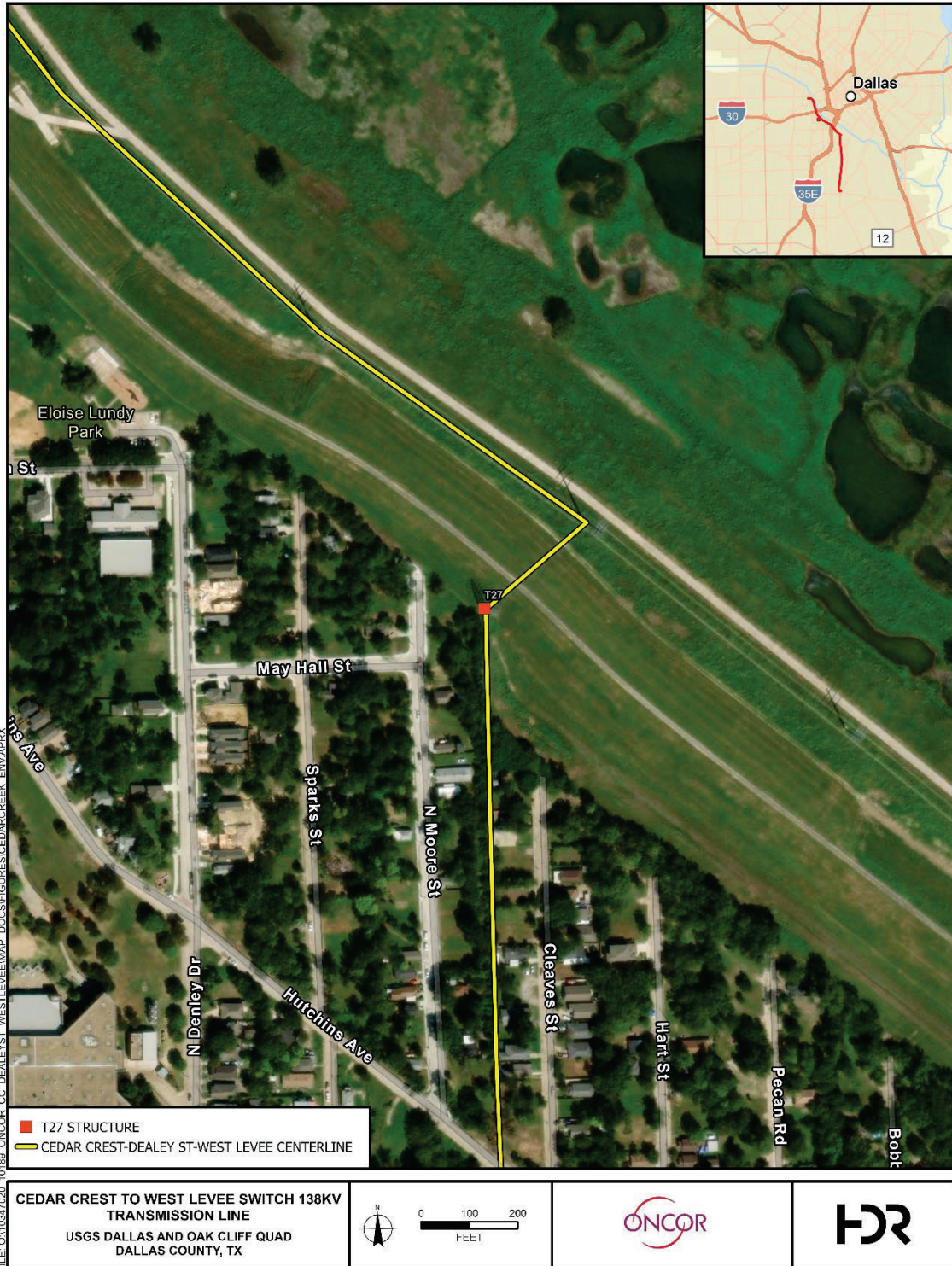
Figure 2. Detailed location of structure T-27 along Cedar Crest to Dealey Street to West Levee Switch 138 kV transmission line