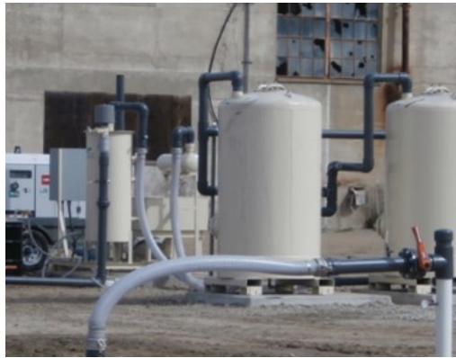
An extraction system removed vapors from the soil