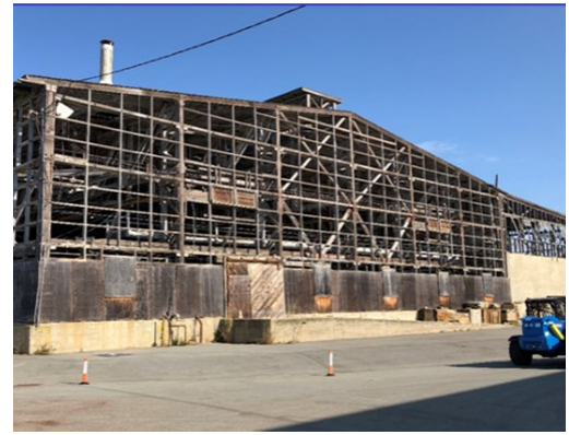
Demolition of Building 123 allows access to remove contaminants from underlying soil