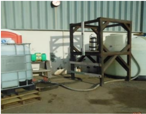
Bacteria was used to treat groundwater at IR-10