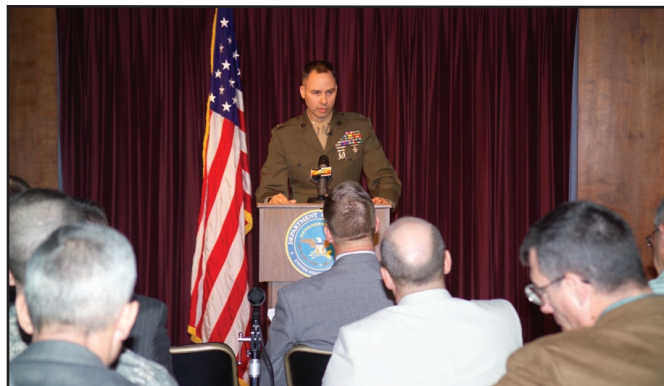
Student USPACOM Commander conducts a media briefing

recommendations and the design and structure of the exercise (a two-semester system played out for three days each within the two-world construct), which ensured numerous opportunities for student learning.