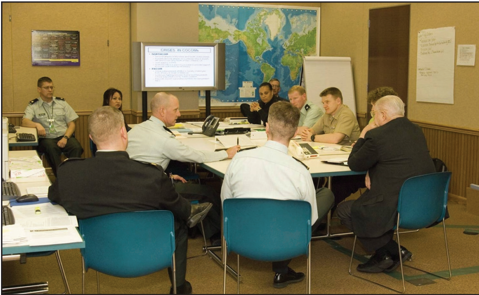
Students Participate in a Daily AAR

Multiple regional scenarios set in the year 2021, featuring crisis situations ranging from major combat operations to humanitarian assistance, helped drive play, and supporting documentation (national strategic and operations-level directives, policies, and plans) also framed the environment. Electronic communications and coordination tools were also placed at the students' disposal, giving them the voice, digital, and VTC capabilities that they would possess in the real world. Thus enabled, the students drove the interagency, military crisis planning and execution, military sustainment, and multinational coordination processes, to include conducting PCCs, DCs, "tank" sessions, and resourcing boards.