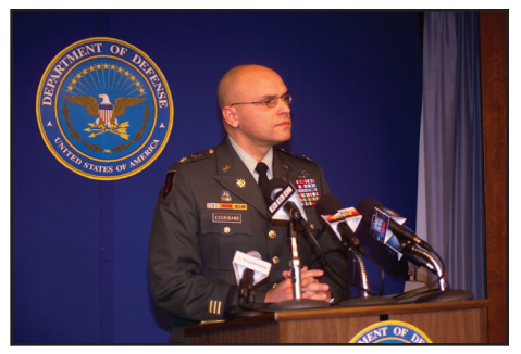
Student SOUTHCOM Commander takes questions during a press conference

tary Services and the Geographic Combatant Commands). Manning for these organizations was designed to break the familiar seminar mold: students were deliberately scrambled so that they had to develop key working relationships with new faces. Organization leaders were designated based on faculty recommendations. The design and structure of the exercise, which includes two threeday semesters along with the two-world construct, ensured numerous opportunities for student learning.