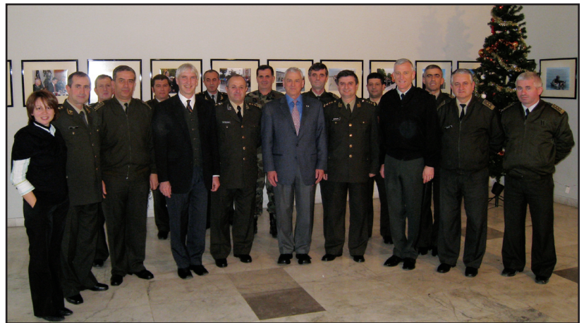
Albanian Armed Forces Strategic Planning Seminar attendees.

Structurally, the AAF faces the same challenges as many small militaries, how to adequately staff, plan, and execute without exhausting the limited manpower and talent pools. An ongoing initiative developed with the assistance of the U.S. Defense Modernization Team-Albania is an attempt to combine the MOD and GS into a single entity to decrease the duplication of effort and increase the understanding of military and civilian aspects of the strategic planning and resourcing process. From a mission capabilities standpoint the AAF has a modular structure roadmap that postures them to be both a viable force for homeland defense, while at the same time possessing the ability to provide value-added to a larger NATO operation. Moreover, in addition to a conventional defensive and stability operations capability, the military will have the resources for natural disaster response, a capacity that is particularly important in the seismic Balkan region in which Albania is located.