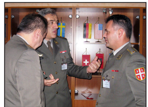
What is Strategic Leadership?

Strategic leaders live in the three worlds of alignment, visioning, and change. They are responsible for ensuring sustainable competitive advantage by providing the effective long-term focus to align ends, ways, and means. At lower levels strategy can be dictated, but the strategic leader must achieve success by building teams and consensus. Using the U.S. Army's parameters for defining strategic leaders, the team was able to illustrate the key differentiators between leaders in strategic positions, those who plan and recommend; and strategic leaders, those who have the responsibility for large organizations and the authority to allocate resources. Such a distinction is considered so important by the U.S. Army, that it has identified these individuals by position. 3