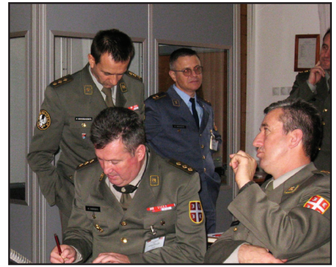
SAF planners address the issues in the JSPS practical exercise

In operation, the JSPS reinforces the importance of the three critical skills employed by General Marshall. Tasked to conduct independent assessments; provide independent advice to the President (POTUS), Secretary of Defense (SECDEF), National Security Council, and Homeland Security Council; and to assist the POTUS and SECDEF in providing unified strategic direction to the Armed Forces, the CJCS leans on the institutionalized processes of the JSPS to ensure alignment, visioning and change are addressed at all critical nodes. The TCT walked the SAF participants through the JSPS process, emphasizing the importance of interagency consensus throughout. As it exists, the JSPS is not easily transferable to the Serbian Ministry of Defense (MoD) processes. To determine how the assess, advise, direct and execute functions are institutionalized within the SAF general staff processes, the planners participated in a Role of Leadership in the Strategic Planning, Capabilities Assessment, and Oversight practical exercise (PE).