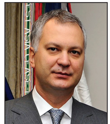
Serbian Minister of Defense Dragan Šutanovac

With the elimination of conscription in December 2010 paving the way to the conversion of the Serbian Armed Forces (SAF) into an all-volunteer force of professional soldiers, the Republic of Serbia is a strong advocate for using international resources to further their planning and operational capabilities. According to Serbian Minister of Defense Dragan Šutanovac, it is in the mutual interest of NATO and Serbia to continue to strengthen their collaboration by taking full advantage of the PfP program. Minister Šutanovac emphasized that this ongoing collaboration over the past six years has helped the Serbian Armed Forces (SAF) become one of the most trusted institutions in the Republic. 2 The overall strategy employed to achieve this public esteem has two lines of effort (LOE). The first LOE is focused, as mentioned above, on employing the resources available through the PfP program, while the second LOE is internal and reflects an evolving Serbian professional military education program.