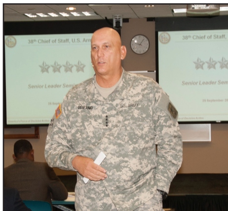
General Ray Odierno, 38th Chief of Staff of the U.S. Army speaks on Army Issues and Future Direction

The secondary objective of the course was to provide talented Army colonels and civilians with an opportunity to raise issues and concerns to TRADOC and Army leadership. The tertiary