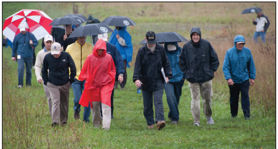
Deloitte executives walk Pickett's Charge in the rain on the Gettysburg Battlefield