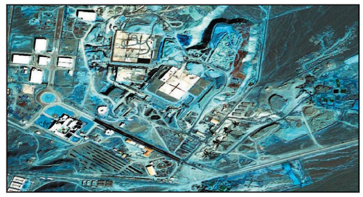
Figure 2. Enrichment Plant Construction.