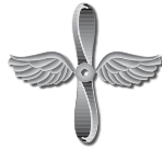
AD Aviation Machinist's Mate