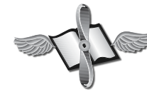
AZ Aviation Maintenance Administrationman