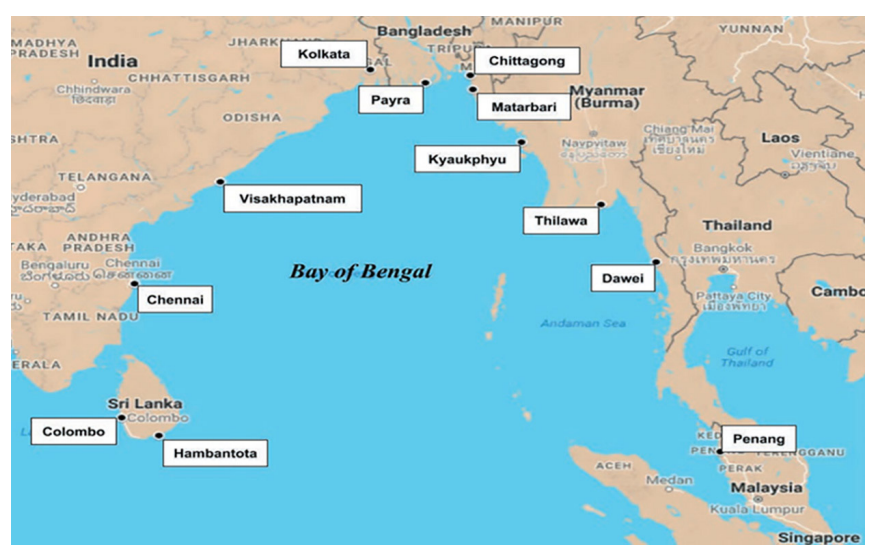
Figure 4. Major port and special economic zones on the Bay of Bengal<sup>43</sup>

Myanmar, stagnant and isolated throughout over half a century of military rule, has begun to develop new industrial parks, incentivized as SEZs, that have the potential to support transnational supply chains. Explosive growth in China's Yunnan Province to the northeast is generating demand in Myanmar for transit infrastructure in the pipeline, road, and rail sectors, with the Kyaukphyu-Kunming gas and oil pipelines already completed. Meeting those transit needs would substantially deepen Myanmar's interdependence with China's southwest, especially Yunnan. The China-Myanmar Economic Corridor—one of the six BRI economic corridors—is a testimony to this and reflects a potential for BoB connectivity on an even greater scale. However, Myanmar's economic attractiveness is currently clouded by last year's military coup and continuing public resistance.