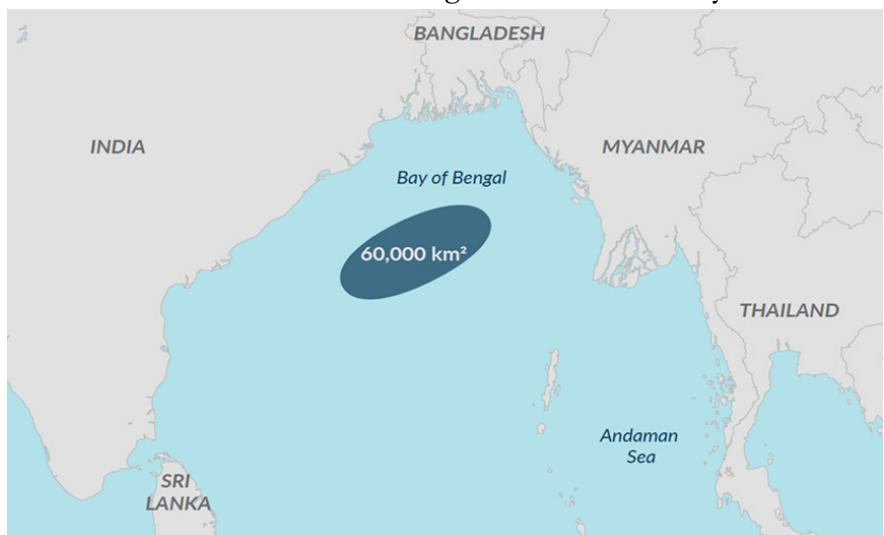
Figure 5. Approximate location of the dead zone.

In 2016, a multinational team of scientists reported an alarming finding that a "dead zone" of significant size has appeared in the bay. Apart from sulfur-oxidizing bacteria and marine worms, few creatures can live in these oxygen-depleted waters. This zone already spans some 60,000 square kilometers and appears to be growing. The dead zone of the BoB is now at a point where a further reduction in its oxygen content could have the effect of stripping the water of nitrogen, a key nutrient. The scientists who identified the Bay's dead zone warn that this stretch of ocean is approaching a tipping point that will have serious consequences for the planet's oceans and the global nitrogen cycle. This poses serious risks to the region's fishery and human security—millions of people could lose their livelihoods, which will create vast streams of new migration across the Bay.