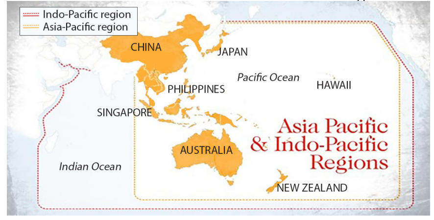
Figure 1. Asia-Pacific and Indo-Pacific.

It was a clear indication that not only the Pacific Ocean but also the Indian Ocean are important bodies of water and the "confluence" of the two oceans has become more critical than ever. The speech became relevant at the time, when preceding frameworks such as the "Asia-Pacific" were proving to be limited in their scope, failing to meet emerging geopolitical realities. The Indo-Pacific is, in effect, a proposed new conceptual map that would transcend the traditional mental divisions between the Asia-Pacific and the Indian Ocean region.<sup>8</sup>