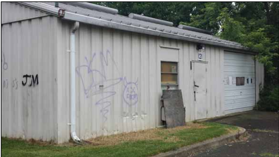
Photo 4 Maintenance Building