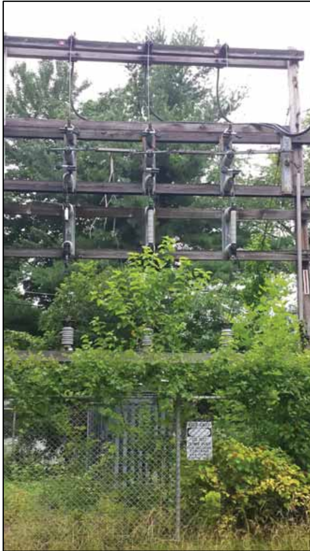
Photo 7 Power Transfer Station