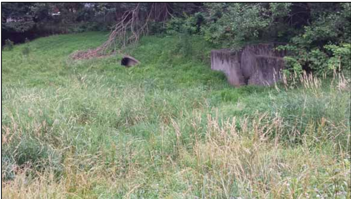
Photo 6 Stormwater Retention Pond