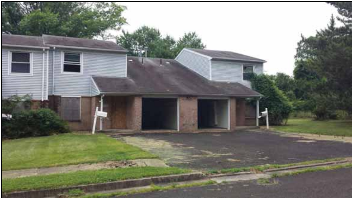
Photo 2 Typical Shenandoah Woods Housing Unit