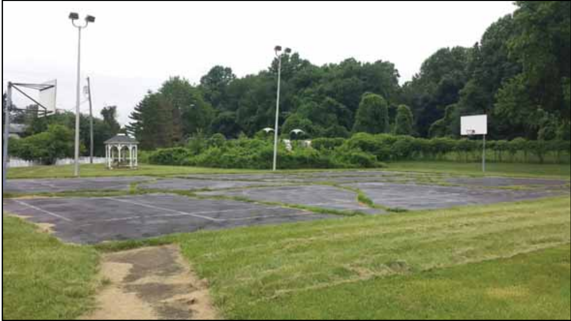
Photo 5 Recreation Area