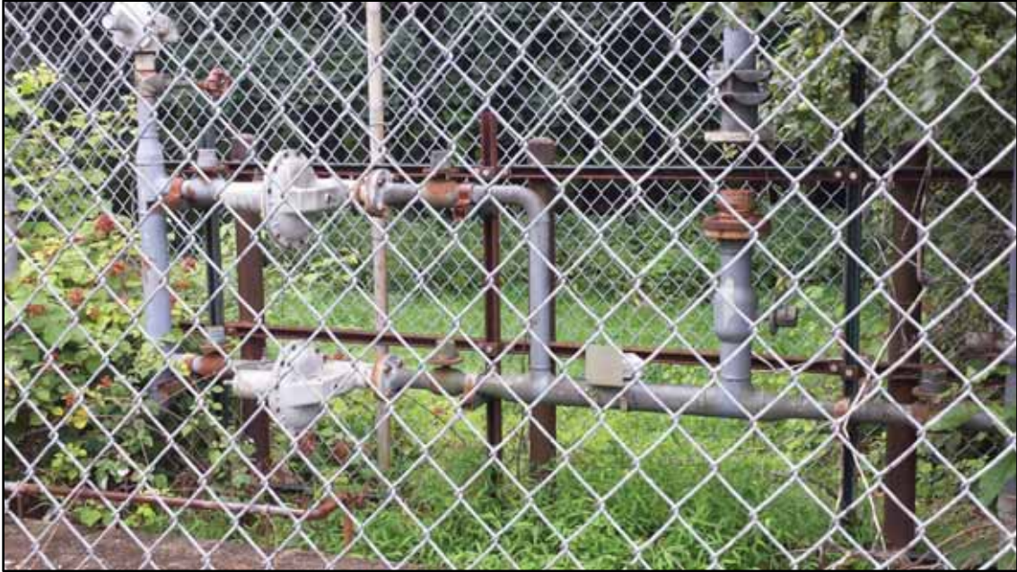
Photo 7 Gas Main