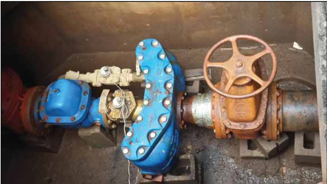
Photo 8 Water Main Valve