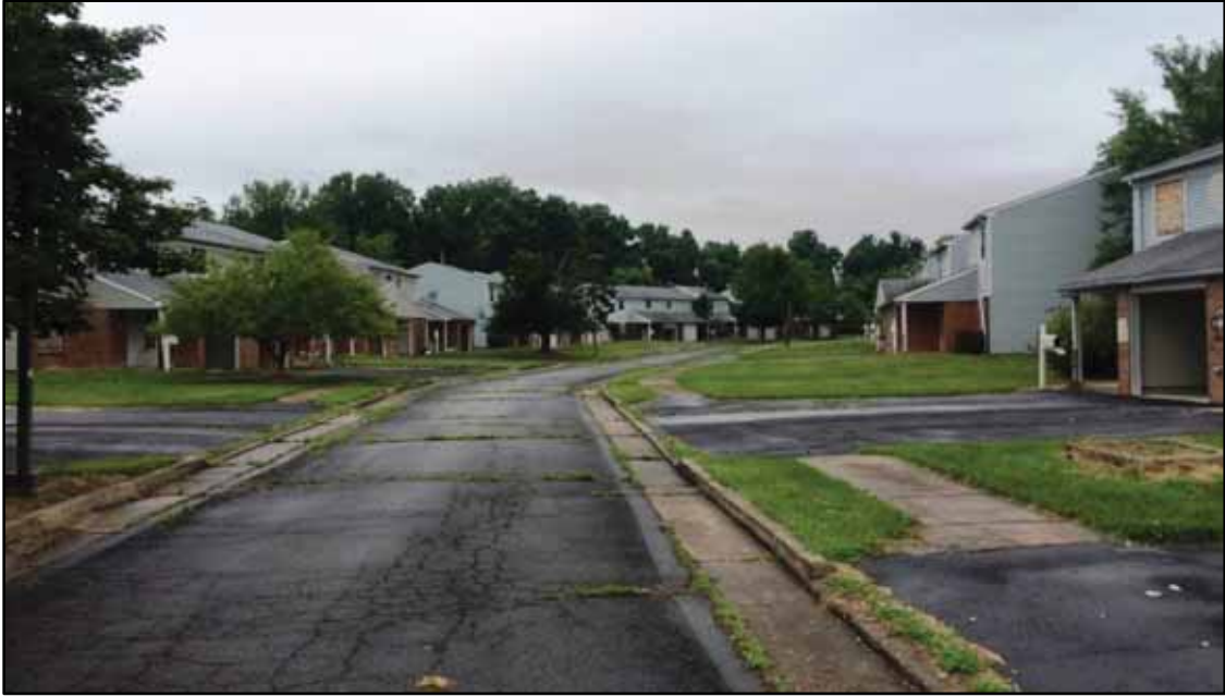
Photo 1 Typical Shenandoah Woods Housing Units