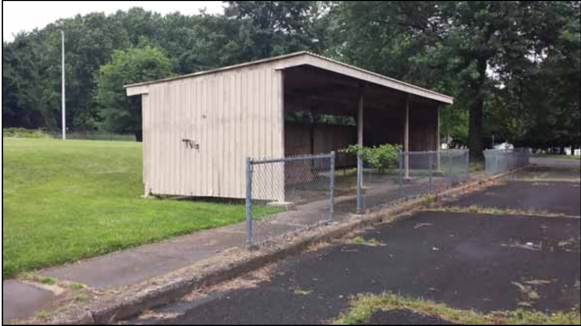
Photo 3 Bus Stop Shelter