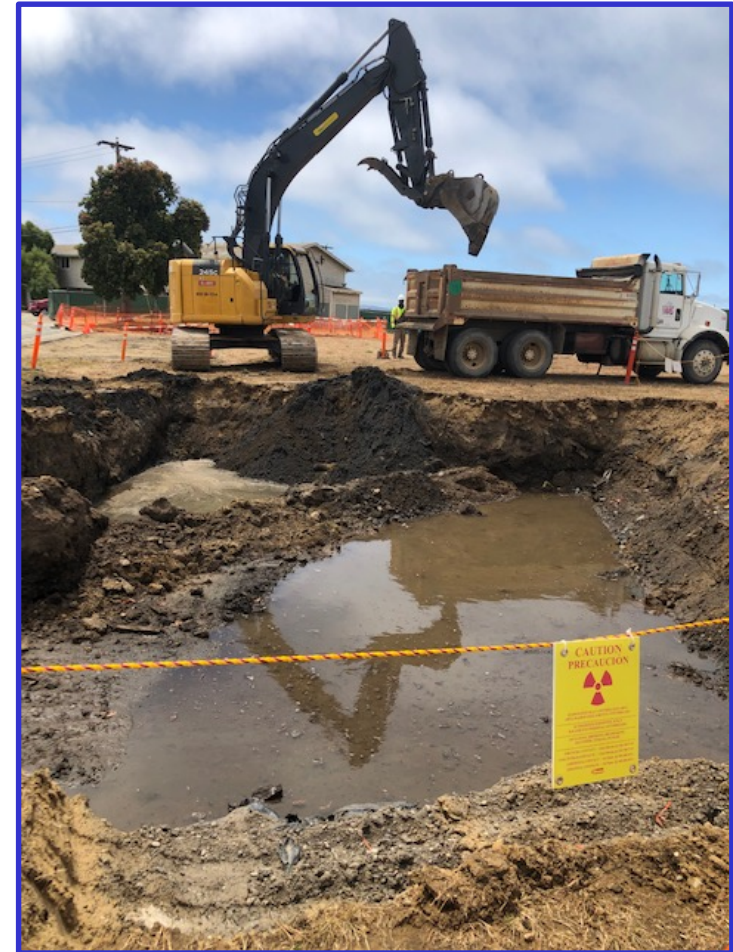
- Excavation/Transport to Site 32 from Northpoint SWDA