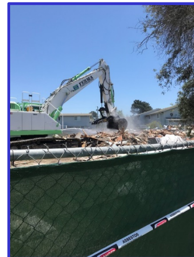
- Demolition Building 1217