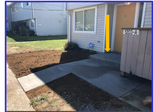
- Building 1203 Post-Excavation