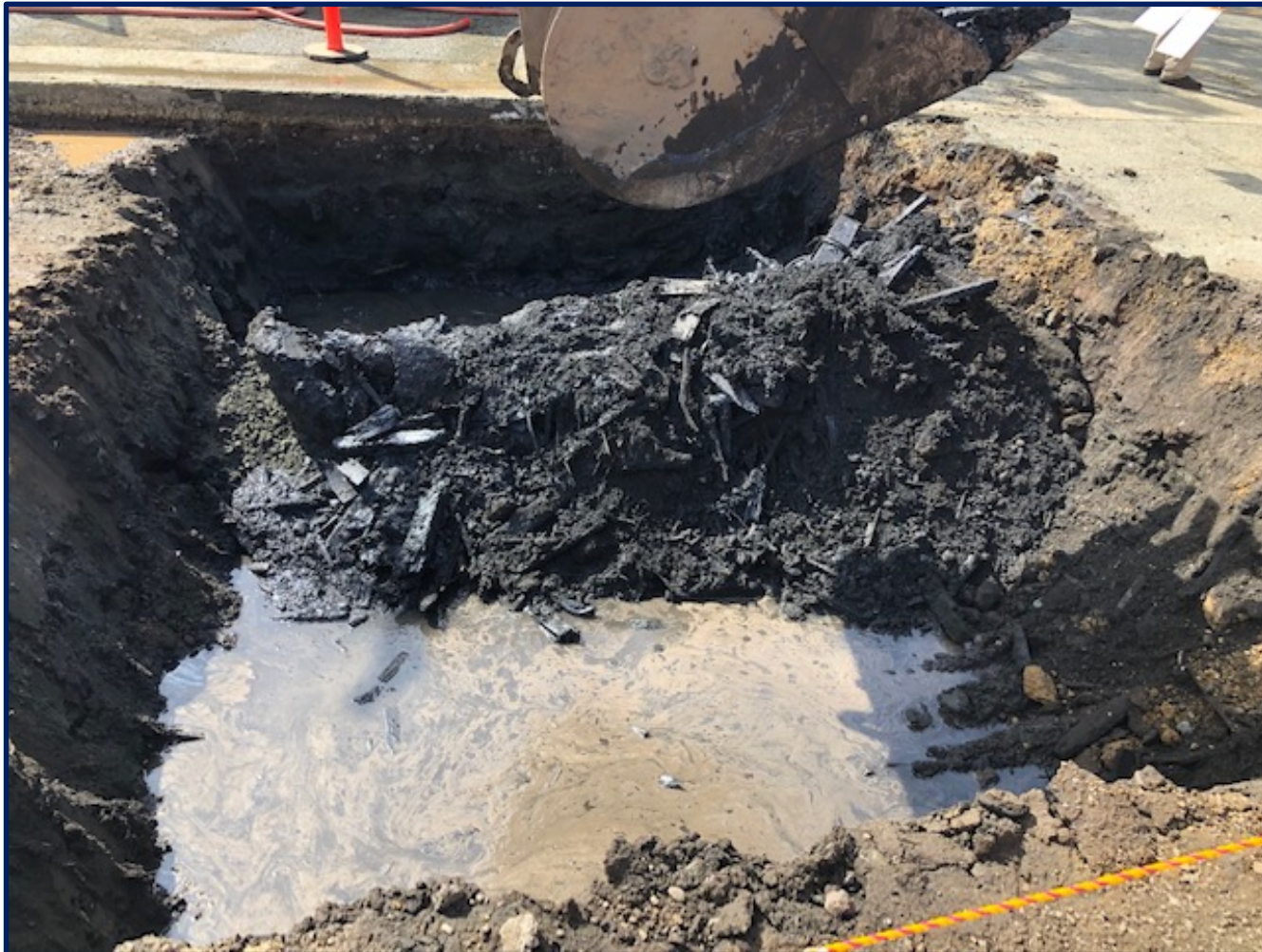
- Timbers exposed at Northpoint