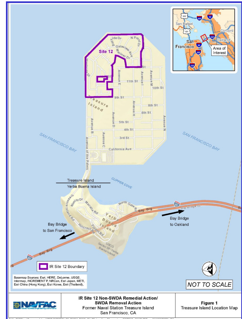
- Site 12 Location