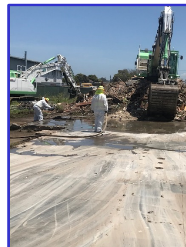
- Cleared Pad at Building 1126