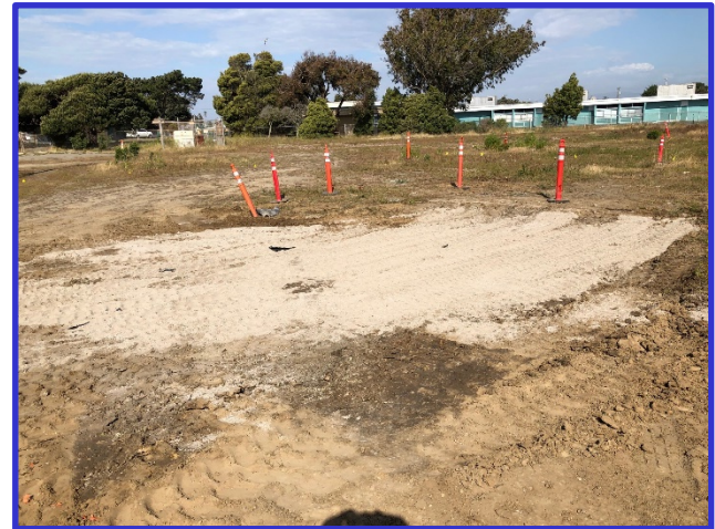
- Backfilled Excavation at Halyburton Court