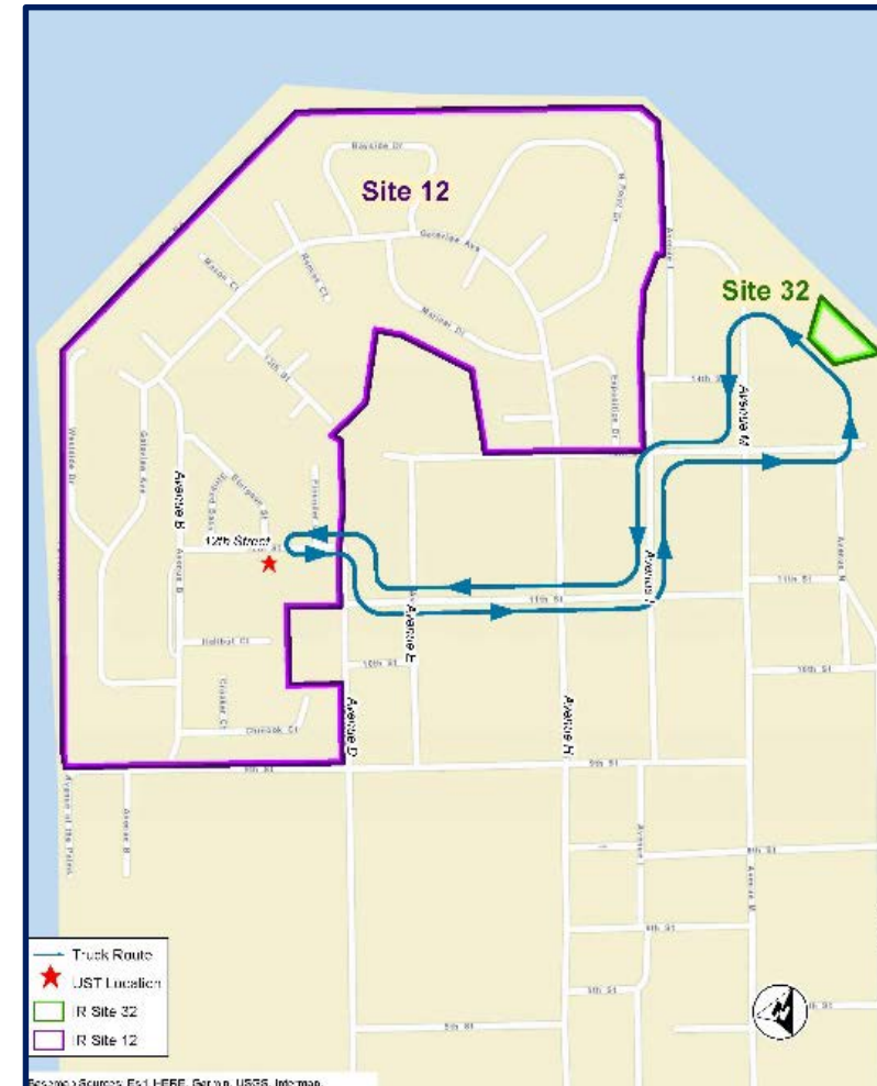
- Location of Underground Storage Tanks and Trucking Route