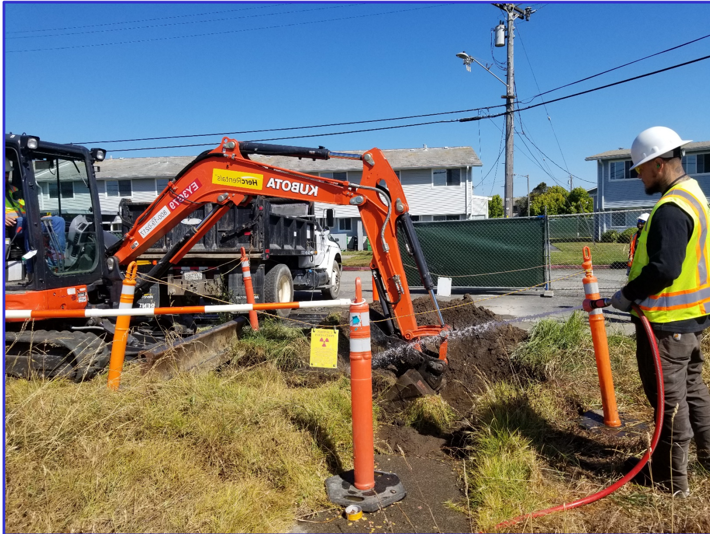
- Chemical Excavation in Site 12