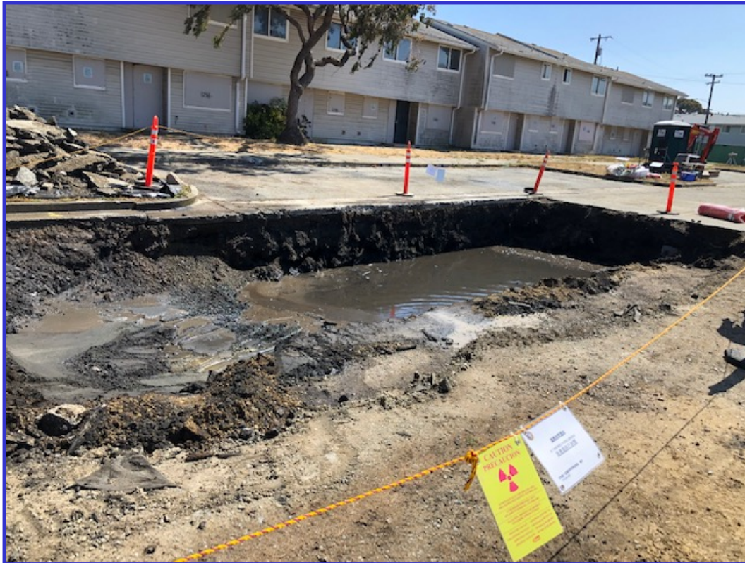
- Excavation at Northpoint SWDA