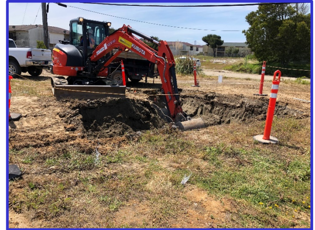
- Halyburton Court Excavation