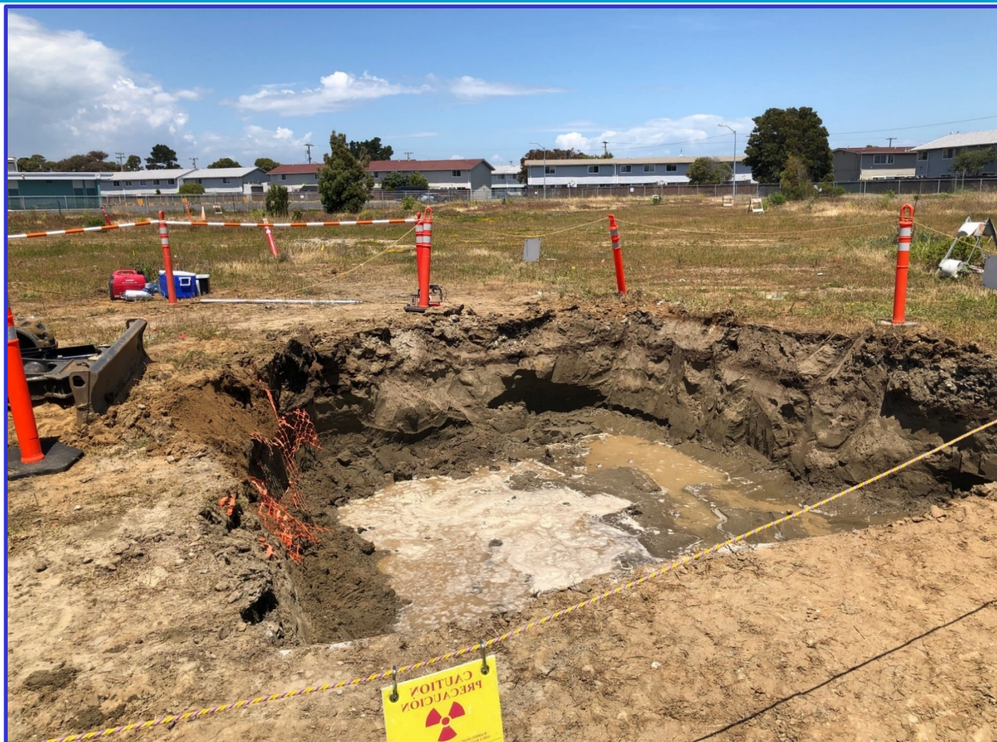
- Excavation in Halyburton Court