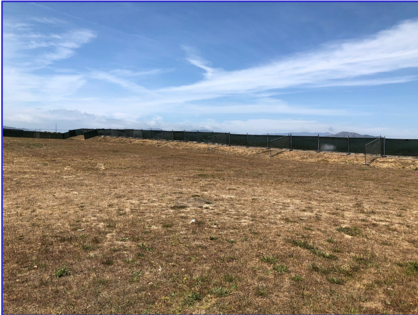
- Northpoint Temporary Fence at Perimeter Rd