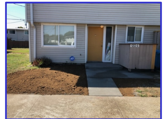
- Building 1203 Post-Excavation