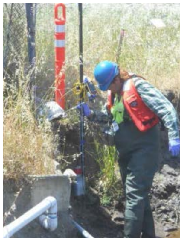
Radiological scanning on North Point Drive.