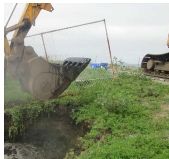
Digging at North Point next to Perimeter Road.