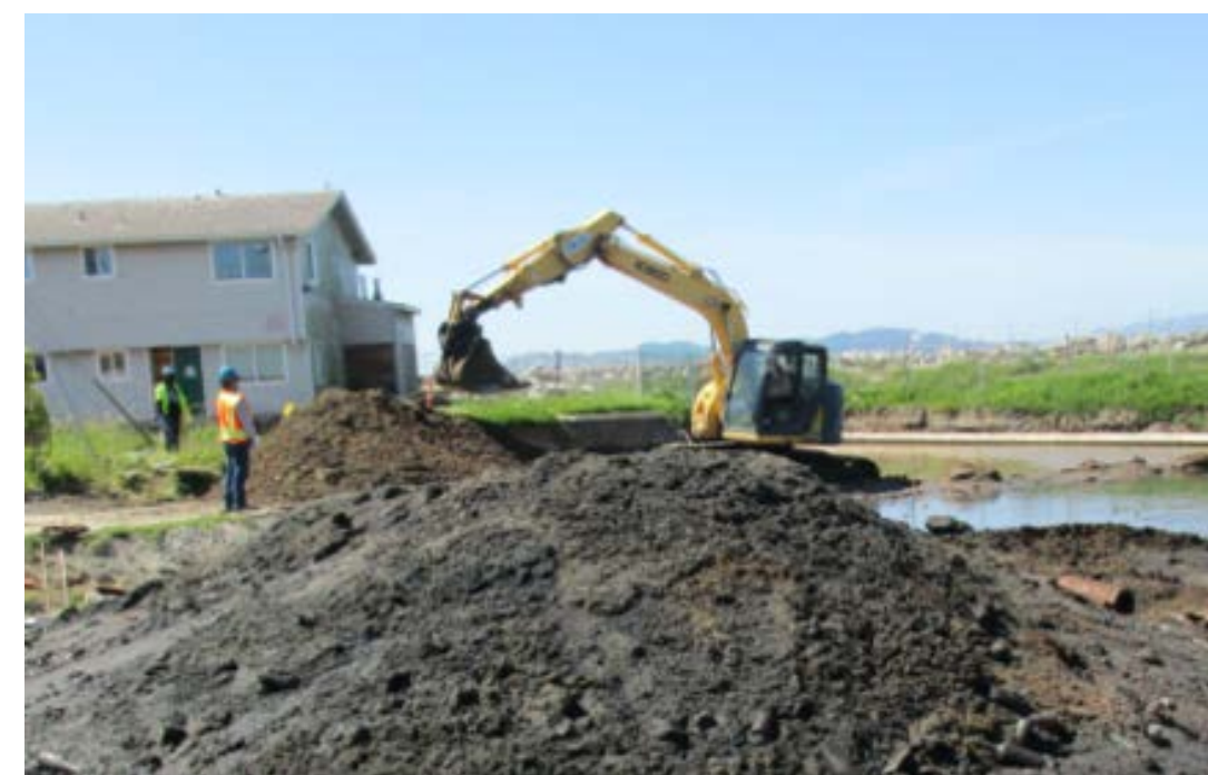
Excavating material and debris from the Historic Burn area on Bayside Drive.