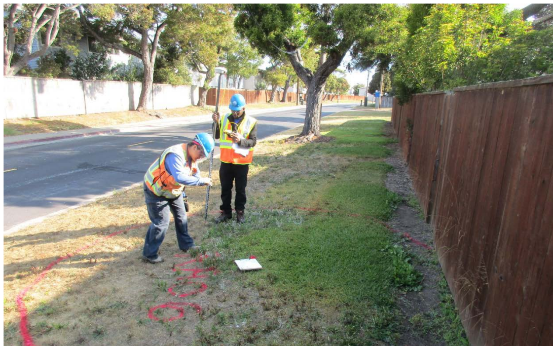
Field technicians use GPS to mark the areas for the small soil excavations. These non-radiological excavations will take place this summer within the TI Housing Area.