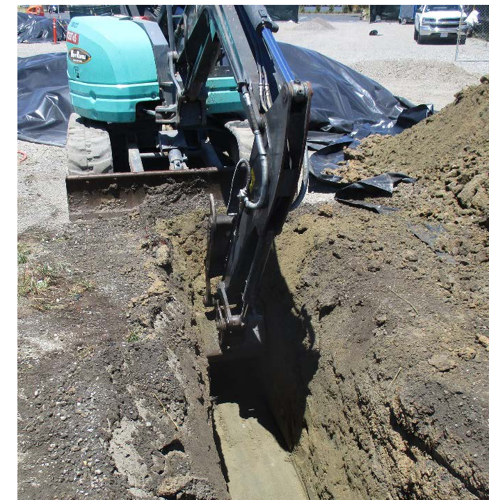
A small excavator is used to dig a trench. Excavators will be used at some locations in the Housing Area.