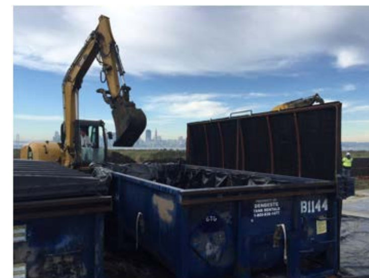
Loading soil into bins for Off-Site Disposal.