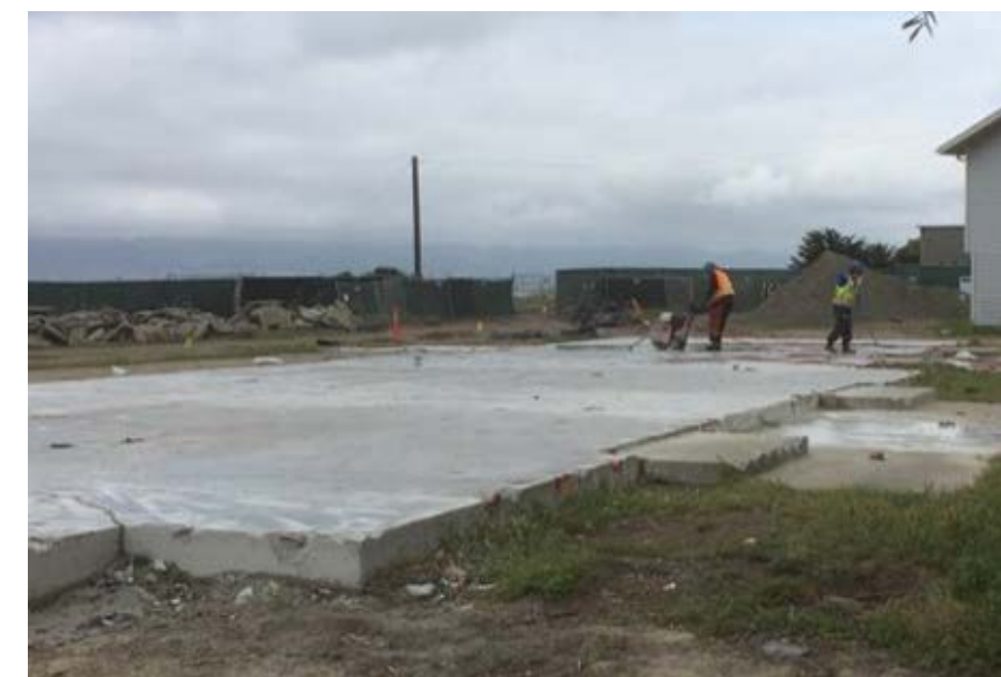
Survey and concrete sampling of Building 1235. Saw-cutting of the Building 1235 foundation in preparation for removal.