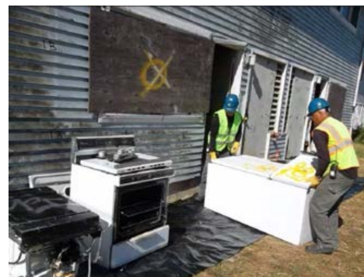
Removing appliances at Halyburton Ct before building demolition.

See below for a selection of photographs from recent field work