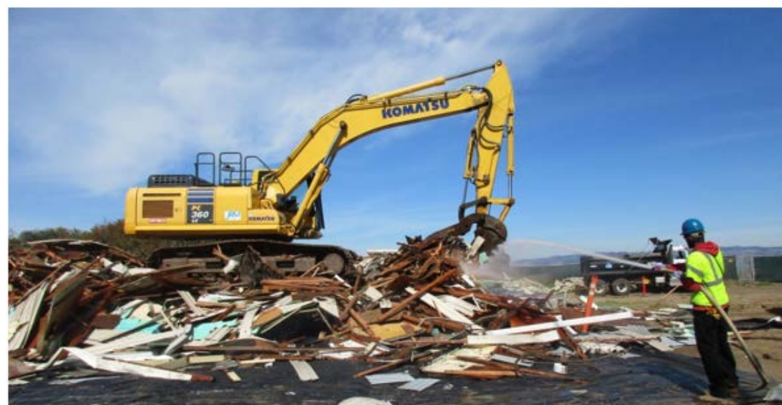
Demolition of Building 1235 in February 2016.

If you have concerns, please call Keith Forman, the Navy Environmental Coordinator at (415) 308-1458. Please leave your name and contact information if you want a call back.