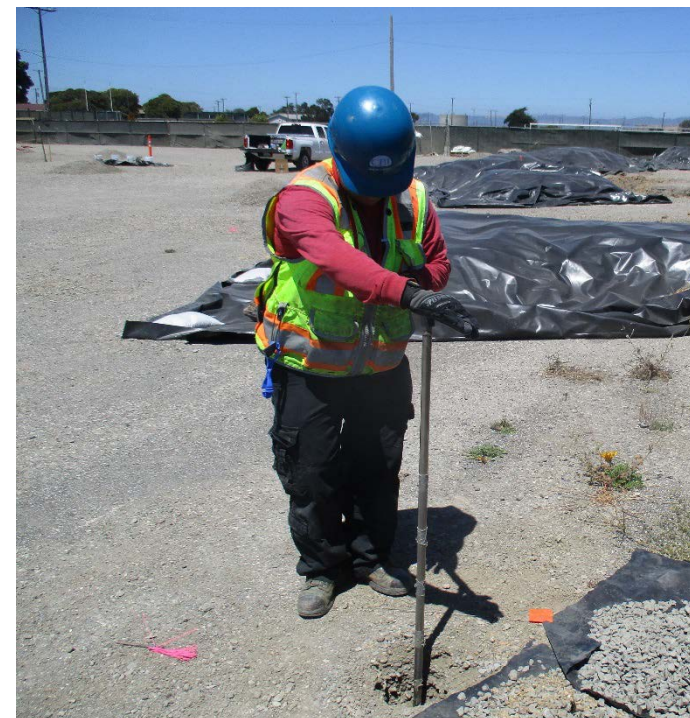
A technician uses a hand auger to collect soil samples. A hand auger will be used at many locations in the Housing Area.