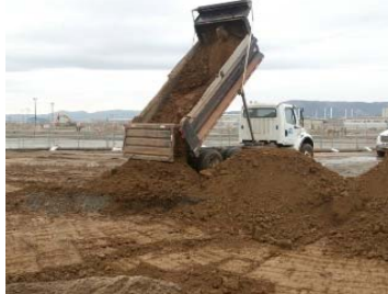
After excavation of contaminated soil is complete, clean imported soil will be used to backfill the site