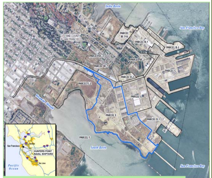
Figure 1: Hunters Point Naval Shipyard Location

During the Phase 3 cleanup activities at Parcel E, the Navy plans to excavate and dispose off site 2,000 cubic yards of contaminated shoreline soil and sediment, install a 1,090-foot long slurry wall to control groundwater discharge to the Bay at Installation Restoration (IR) Site 02 Northwest, and construct 3,730 feet of shoreline protection along IR-02, including a concrete seawall, to prevent erosion. Soil excavated from radiologically impacted areas will be tested for radionuclides of concern, and if detected above project action levels, this soil will also be removed and properly disposed off site. During