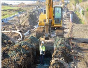
An underground barrier (slurry wall) will be installed to control the migration of contaminated groundwater from a portion of Parcel E to the Bay