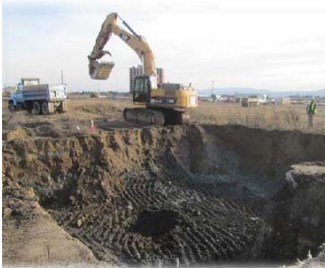
Excavation removes soil and sediment contaminated with metals, polychlorinated biphenyls, petroleum, and organic chemicals