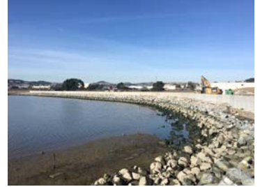
Construction of shoreline protection features using natural materials prevents exposure to remaining contaminants in nearshore soil and sediment

Department of the Navy BRAC Program Management Office West 33000 Nixie Way, Building 50, 2nd Deck San Diego, CA 92147