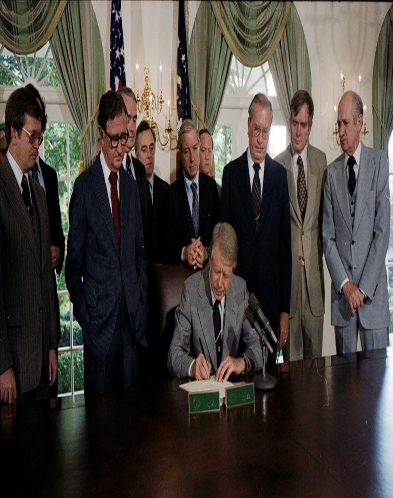
President Jimmy Carter signs the Inspector General Act on October 12, 1978.