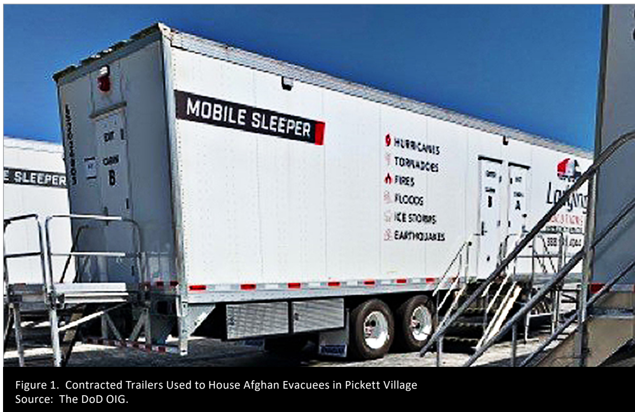
Figure 1. Contracted Trailers Used to House Afghan Evacuees in Pickett Village

TF Pickett's initial plan was to use existing hard structure buildings to house, care for, and feed Afghan evacuees. The Fort Pickett garrison personnel identified available one- and two-story barracks sufficient to house Afghan evacuees. 8 In addition, TF Pickett officials awarded a support contract to house, care for, feed, and provide security for additional incoming Afghan evacuees. The contract provided 165 trailers to house an additional 5,000 Afghan evacuees. TF Pickett personnel called the area with the 165 trailers Pickett Village. Figure 1 is a picture of the contracted trailers from Pickett Village.