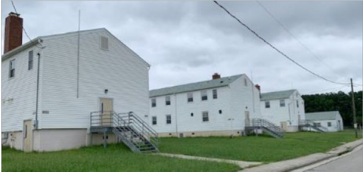
Figure 2. Barracks Housing for Afghan Evacuees at Fort Pickett

The occupancy of the barracks varied; however, the average occupancy of each barrack building was 85 persons. The Fort Pickett barracks area had its own dining facilities, restrooms, and shower facilities for Afghan evacuees housed there. Figure 2 is an example of the barracks used by Afghan evacuees at Fort Pickett.