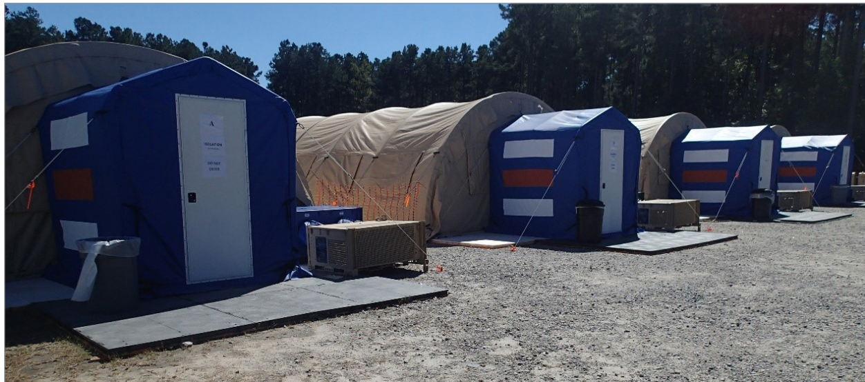
Figure 3. Medical Isolation Tents

Throughout Fort Pickett, there were barracks and trailers designated as isolation facilities to separate Afghan evacuees with communicable diseases and prevent the spread of disease. TF Pickett personnel stated that they offered the entire family of an infected individual the option to isolate together. In addition, the contracted medical care provider had medical isolation tents for Afghan evacuees with communicable diseases. Figure 3 is an example of the contractor-provided medical isolation tents at Fort Pickett.