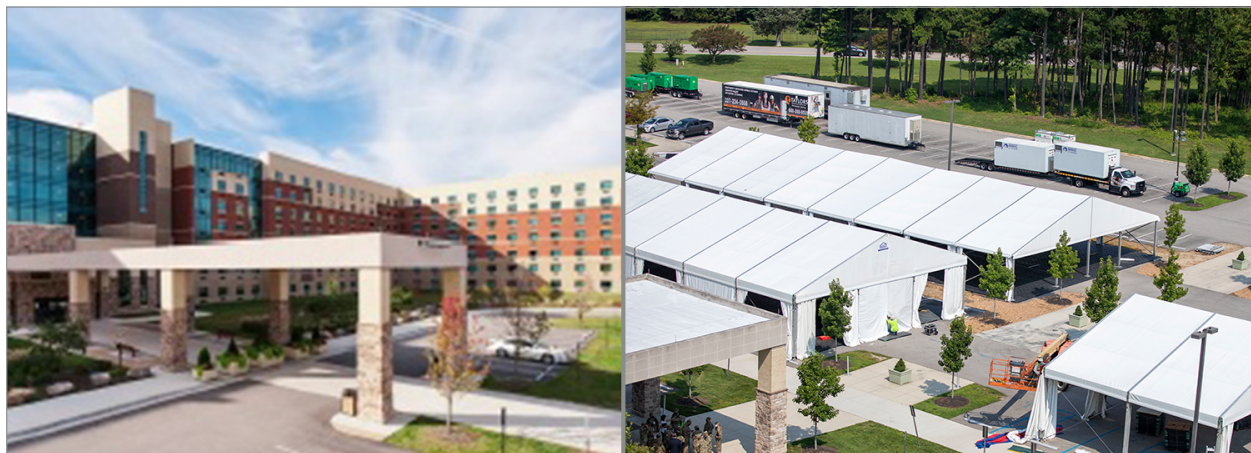
Figure 1. Holiday Inn Express at Fort Lee

TF Eagle used an existing hotel on Fort Lee to provide Afghan evacuees with solid structure housing. The U.S. Army constructed the 7-story hotel in December 2012. The audit team observed that floors 4 through 7 of the hotel were reserved for housing Afghan evacuees. These floors totaled 512 standard rooms and 64 family suites. According to the Hospitality Operations Manager, four people were housed in each standard room and six in each family suite. See Figure 1 for a picture of the hotel used to house Afghan evacuees at Fort Lee and some of the tents built around the hotel for services such as dining and recreation.