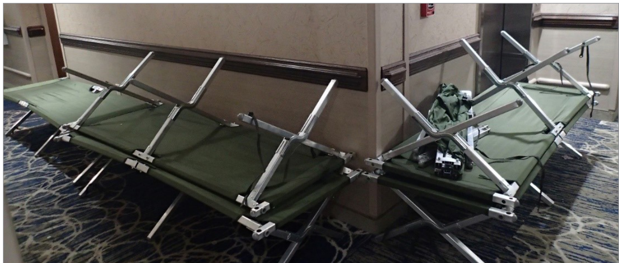
Figure 3. Example of Cots in the Hallways in the Hotel

TF Eagle personnel provided Afghan evacuees cots to supplement the one bed in each room. During a walkthrough, DoD OIG engineers found that, in some instances, cots had been moved into the hallways to make more space in the rooms. Figure 3 is a photograph taken during the DoD OIG walkthrough showing cots stored in a hallway. Cots or other supplies blocking the hallway created a tripping hazard that could impede an evacuation.