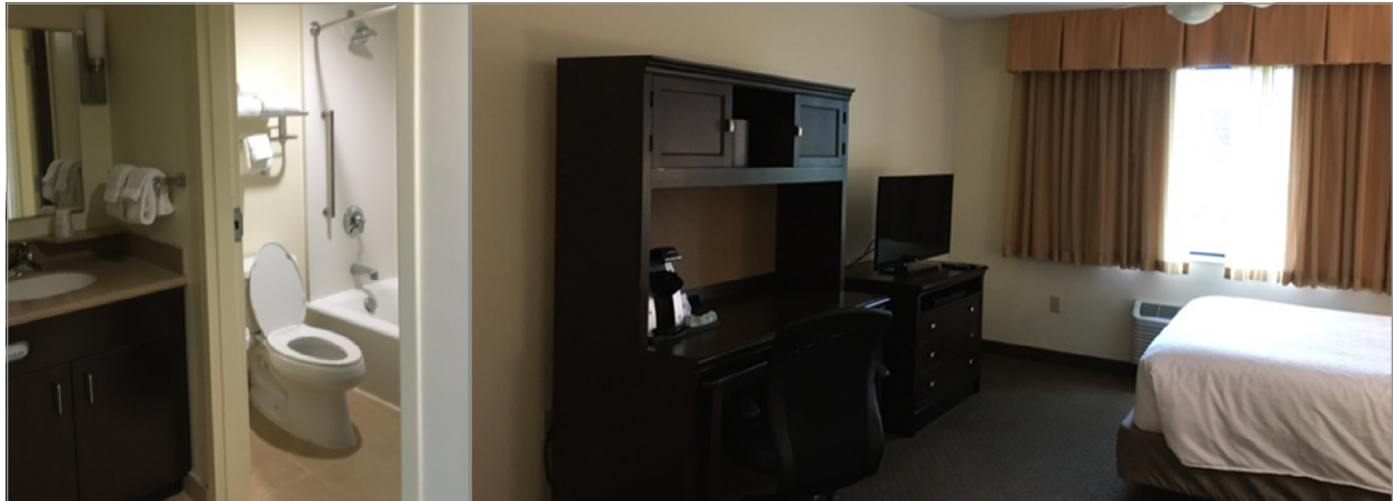
Figure 2. Example of a Hotel Room Inside the Holiday Inn Express at Fort Lee

the hotel front desk when needed. Due to the nature of hotel processes, this reduced the burden of distributing hygiene items individually through a central processing point and reduced the waste created by reliance on single-use packages. Laundry machines and laundry detergent were also available for Afghan evacuees to use, free of charge, on each floor of the hotel. See Figure 2 for pictures of a hotel room and bathroom at Fort Lee.