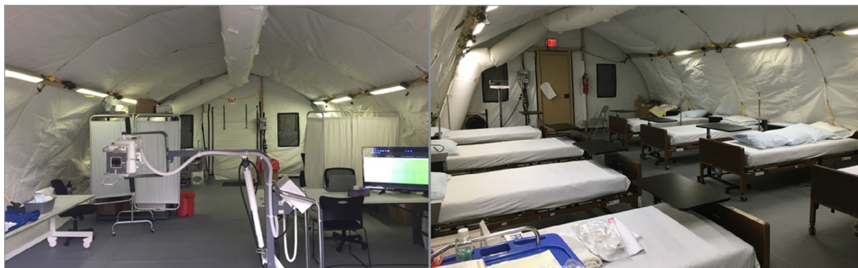
Figure 4. Pictures of Medical Tents

TF Eagle established a dedicated contracted medical treatment area composed of eight portable tents. The audit team toured the contracted medical treatment area and confirmed that there were eight portable tents for different medical services, sleeping and holding areas, bathrooms, showers, and ambulances for medical emergencies. See Figure 4 for an example of the inside of one of the contracted medical tents.