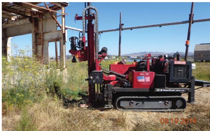
Temporary well installation at PMA

Groundwater data from the groundwater well installation and sampling event will be used to supplement the ongoing remedial investigation at each site.