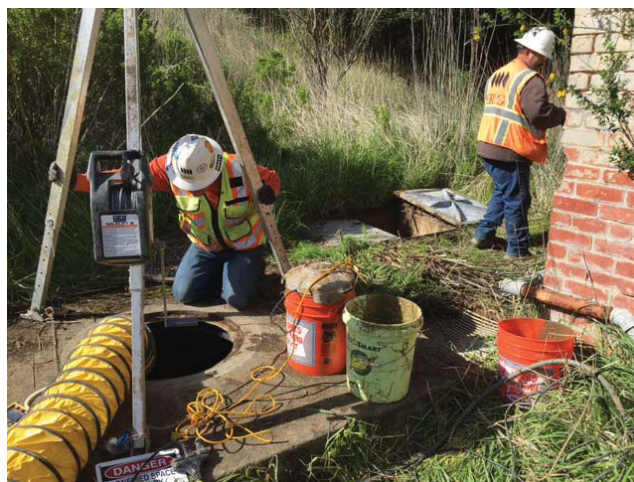
PCB Remediation in Subsurface Vaults at Building A17

A142. Concrete and soil verification samples were collected from the remediated areas.