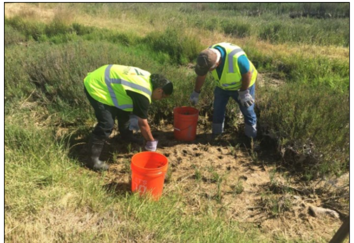
Pickleweed planting at the Paint Waste Area – June 5, 2019

From May 28 to June 6, 2019, the Navy performed weeding of non-native plants as part of the wetland monitoring restoration activities at the Paint Waste Area. Following the weeding activities, pickleweed cuttings were planted to encourage pickleweed growth to be similar to an adjacent area known as the Pickleweed Harvest Area.