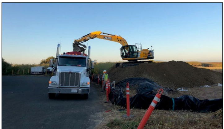
SWMU 78 – Waste soil loading for transportation, November 2018

The Navy completed field work at the SWMU 78 debris pile investigation site. The field work consisted of excavation, soil and debris segregation, soil sampling, transportation of soil and debris off-site for disposal, and backfill.