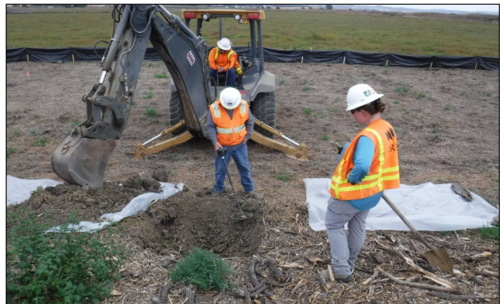
Test pit investigation at Dredge Pond 3E – October 1, 2018

intrusive investigation of radiological and geophysical anomalies, test pit investigations, soil sampling, and site restoration.