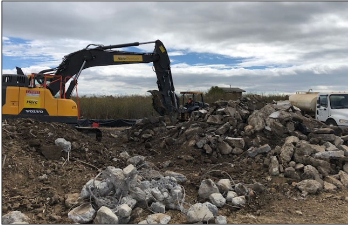
Debris segregation at SWMU 78 – October 4, 2018

The Navy continued field work at the SWMU 78 debris pile investigation site. The field work consisted of excavation, soil and debris segregation, soil sampling, and transportation of soil and debris off-site for disposal. The SWMU 78 field work is expected to be complete the first week of November.