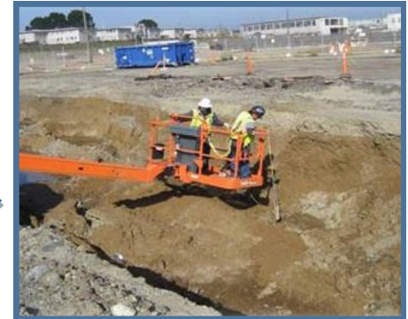
Radiological scans of trench sidewalls and floors may be conducted in-place

A surface scan of excavated soil will be conducted in secure areas, or radiological soil will be separated and scanned during excavation. After excavation, radiological scans of the sidewall and floor soils will be conducted either in-place or excavated and scanned.