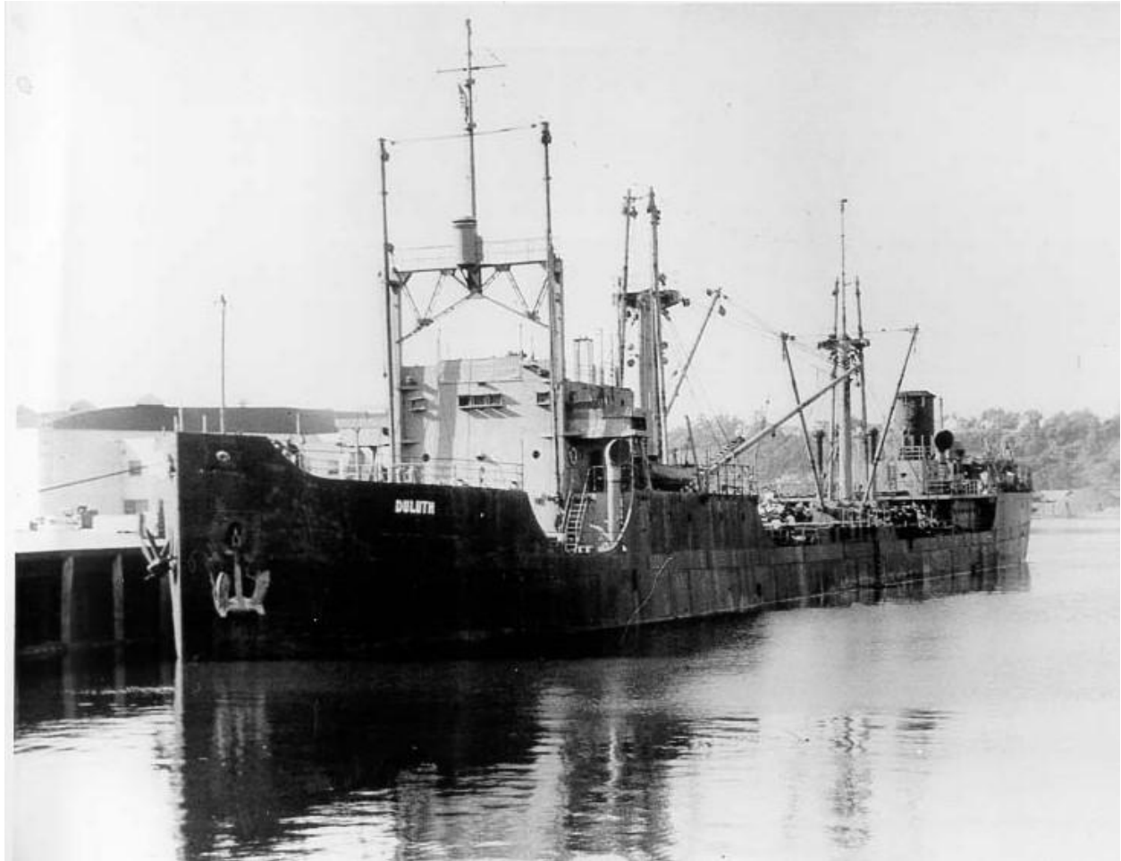
Duluth undergoing conversion to a Army Repair Ship at Oakland.

Even to my untrained eye it was obvious on the first day I first saw her, sometime in June, 1944, that she was far from ready for sea. She lay alongside a pier in Oakland, a striped-down metal hulk aboard which welders' torches flared and electric cables snaked along her decks. For several months, the crew, like commuters on their way to work, would board an LCVP [Landing Craft, Vehicle, Personnel] landing craft each morning for the trip from our barracks to the ship, watching as the guns -- six 20 mm's and a 3-inch aft -- were mounted; life rafts attached and, in the case of we radiomen, the equipment that would eventually keep us in touch with the world when we were thousands of miles at sea installed. The radio shack itself, not much larger than a walk-in closet, was located on the port side in the forward superstructure, a deck below the bridge. Our quarters, which we shared with several members of the bridge gang, was adjacent to the radio shack, a compartment with 6 double-decker bunks, rather spacious for enlisted men.