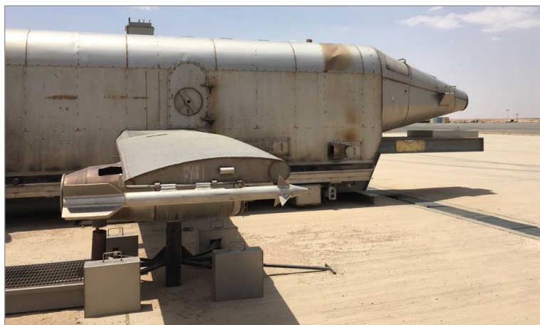
Figure 4. Simulator Located at Camp Buehring, Kuwait

The audit team requested supporting documentation for the actual cost of the simulators, such as a purchase invoice, from Army G-4; however, as of September 17, 2021, we had not been provided with any documentation to support the cost of the simulators. We confirmed that Army financial records listed the simulator; therefore, the Army potentially overstated its financial statements.