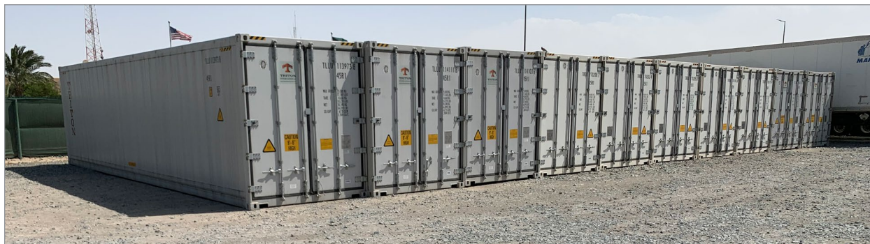
Figure 3. Refrigeration Units at Camp Arifjan, Kuwait

The Kuwait accountable property record included 17 refrigeration units listed for $652,606 each on the accountable property record. Figure 3 is an example of refrigeration units.