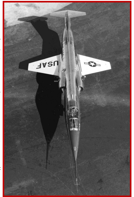
Beautiful overhead view of Lockheed NF-104A 56-0760 which gives a nice perspective of the nose and wing tip modifications made to the Aerospace Trainer aircraft.

Through the apex of the climb at around 90,000 to 118,000 feet, reaction controls were used to keep the aircraft on the correct flight path. The pilot was required to maintain a constant angle-of-attack of 5 to 11 degrees through pull-out. Engine restart attempts began at approximately 70,000 feet with completion of reentry and pullout varying between 55,000 and 40,000 feet. On rare occasions air start could not be accomplished and dead stick landings would occur. The typical zoom mission lasted around 30 minutes.