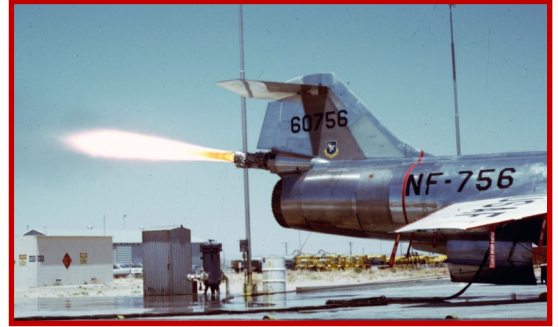
The LR-121-NA-1 rocket engine in NF-104A 56-0762 is test fired on the ground prior to in-flight testing.

All ARPS NF-104A zoom missions were flown from and recovered to Edwards AFB. The typical zoom climb mission began with a full afterburner take-off out to 400 KIAS (Knots Indicated Air Speed) and was then throttled back to military power out to 450 KIAS. The climb continued at .86 Mach number to 35,000 feet and outbound approximately 100 miles from Edwards AFB and then executed a 180-degree turn to align for the inbound zoom profile. At 35,000 feet, the throttle was advanced to full afterburner with rocket power used briefly to pass through the transonic region, once the aircraft passed 1.8 Mach and reached the pull-up mach number, rocket power was used to augment the zoom climb at approximately 70 degrees until hydrogen peroxide was depleted near the zoom apex. As the aircraft passed through 63,000 feet the throttle was brought back to military power and the set in OFF detent as it passed 80,000 feet.