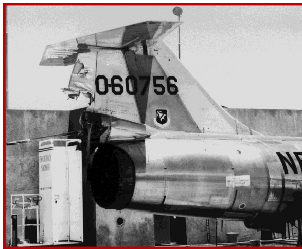
Tail damage of NF-104A #56-0756 on June 15, 1971.

approximately 50 ARPS students experienced zoom climb flights to an average altitude of 106,000 feet in the NF-104A.