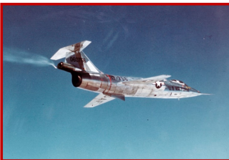
NF-104A 56-0756 in flight at the beginning of another zoom profile check flight out of Edwards AFB, CA.

Three F-104A aircraft chosen for the program, USAF serial numbers 56-0756, 56-0760 & 56-0762 which were all former test aircraft at Edwards AFB. They were delivered to Lockheed in August & September 1962 for modification work. The first NF-104A to fly was 56-0762 on July 9, 1963 out of Lockheed's Palmdale, CA facility with Lockheed pilot Jack Woodman at the controls. This was followed by 56-0756 on August 10 and 56-0760 on September 13. Lockheed performed the functional test flights at Palmdale prior to delivery to the USAF. Woodman shared check flight duties with Major Robert Smith. It was Smith who flew the highest Category 1 zoom flight reaching 118,860 feet on October 22nd in A/C 56-0756. Smith would later be assigned as test director for the NF-104A program and was also responsible for writing the NF-104A flight manual. Woodman followed the next day with a zoom flight to 118,400 feet in A/C 56-0760. The USAF took receipt of the three NF-104A's by October 29th with flight testing continuing with Smith. All flights were now being made from Edwards AFB. During testing, both Smith and Woodman had experienced zoom-induced departed flight and both recovered the aircraft after some very exciting moments.