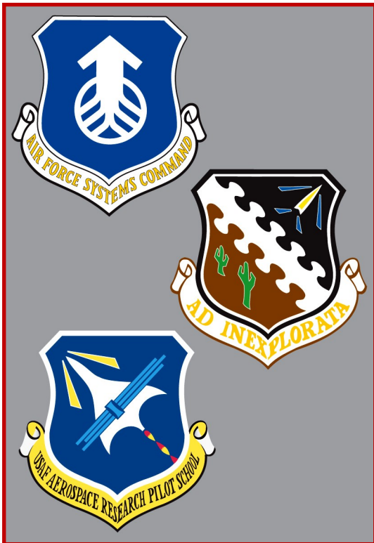
The NF-104 program flown by the USAF Research Pilot School at Edwards AFB fell under the control of Air Force Systems Command.